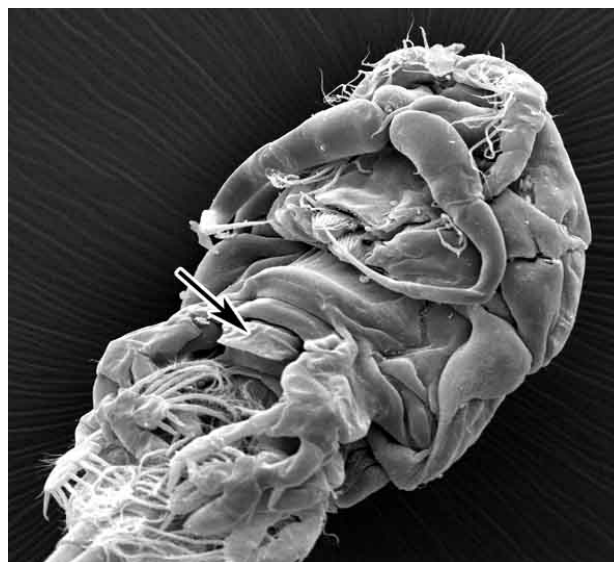
Figure 3. Prosome of Neoergasilus japonicus , ventral. Lake Grand Laouicien, France.

Among the most common food components in N. japonicus stomachs, were colonies of Cyanobacteria and diatoms that could be scraped off stones or other hard substrates. It is possible that the spade-like armament between the cephalosome and urosome with undefined functions, indicated with an arrow in Figure 3 is used by N. japonicus to scrape off the sedentary algae species from a hard substrate.