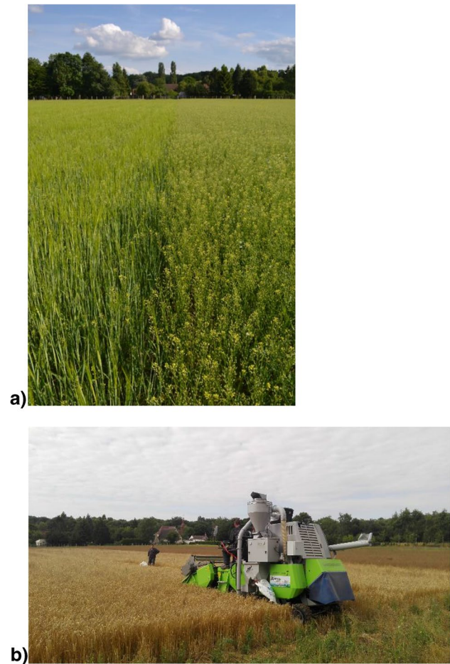
Fig. 1 a Two treatments are applied on 0.25-ha farm to compare different ways of growing camelina (monocropping and intercropping with barley). b Yields of an on-farm trial being measured with harvest equipment rather than with microplot sampling (credit: Margot Leclère).

OFE practices (Cook et al. 2021). In fact, OFEs are part of many coordinated activities comprising innovation processes in which their functions and outputs depend on the actual experimental practices applied. For example, new innovative processes and arrangements (e.g., living labs and transition experiments) link OFE practices to the recognition of the value of combining diverse interests (public and private) and to the fostering of trusting and productive relationships among actors (Schäpke et al. 2018). The renewal of OFE favors "joint exploration whereby researchers and others engage closely with farming realities to align with the ways farmers learn" (Lacoste et al. 2021). Over the past few decades, various on-farm experimentation practices have thus emerged in accordance with and as part of distinct approaches to innovation. These range from technology transfer (where farmers are considered as adopters and scientists innovate from the knowledge they produce) to the farming system research approach (where farmers provide scientists with knowledge and information about