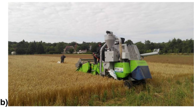
Fig. 1 a Two treatments are applied on 0.25-ha farm to compare different ways of growing camelina (monocropping and intercrop with barley). b Yields of an on-farm trial being measured with harvest equipment rather than with microplot sampling.

OFE practices (Cook et al. 2021). In fact, OFEs are part of many coordinated activities comprising innovation processes in which their functions and outputs depend on the actual experimental practices applied. For example, new innovative processes and arrangements (e.g., living labs and transition experiments) link OFE practices to the recognition of the value of combining diverse interests (public and private) and to the fostering of trusting and productive relationships among actors (Schäpke et al. 2018). The renewal of OFE favors "joint exploration whereby researchers and others engage closely with farming realities to align with the ways farmers learn" (Lacoste et al. 2021). Over the past few decades, various on-farm experimentation practices have thus emerged in accordance with and as part of distinct approaches to innovation. These range from technology transfer (where farmers are considered as adopters and scientists innovate from the knowledge they produce) to the farming system research approach (where farmers provide scientists with knowledge and information about