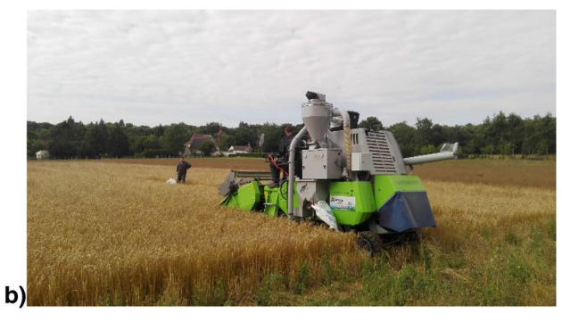
Fig. 1 a Two treatments are applied on 0.25-ha farm to compare different ways of growing camelina (monocropping and intercrop with barley). b Yields of an on-farm trial being measured with harvest equipment rather than with microplot sampling.

OFE practices (Cook et al. 2021). In fact, OFEs are part of many coordinated activities comprising innovation processes in which their functions and outputs depend on the actual experimental practices applied. For example, new innovative processes and arrangements (e.g., living labs and transition experiments) link OFE practices to the recognition of the value of combining diverse interests (public and private) and to the fostering of trusting and productive relationships among actors (Schäpke et al. 2018). The renewal of OFE favors "joint exploration whereby researchers and others engage closely with farming realities to align with the ways farmers learn" (Lacoste et al. 2021). Over the past few decades, various on-farm experimentation practices have thus emerged in accordance with and as part of distinct approaches to innovation. These range from technology transfer (where farmers are considered as adopters and scientists innovate from the knowledge they produce) to the farming system research approach (where farmers provide scientists with knowledge and information about