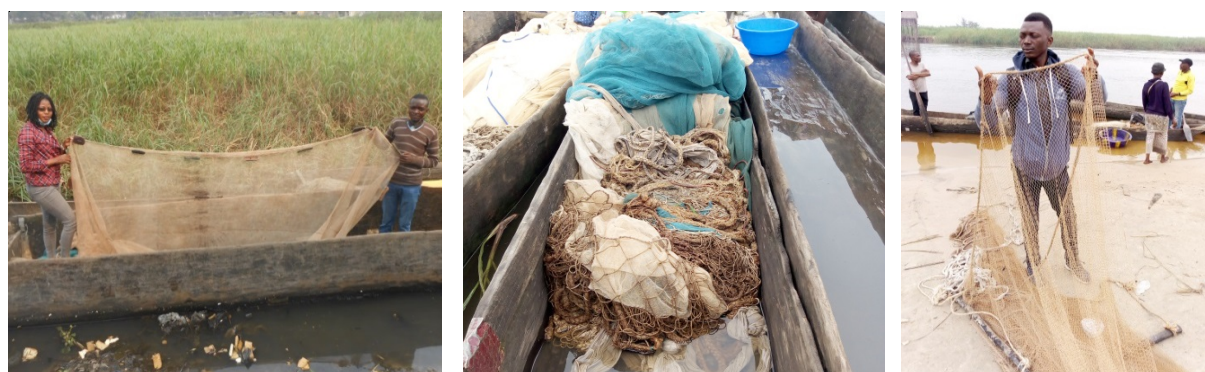
Figure 6; 7 and 8: Fishing gear at the Kinkole site. Figure 7 shows boats with batteries of nets of different mesh sizes, including mosquito netting