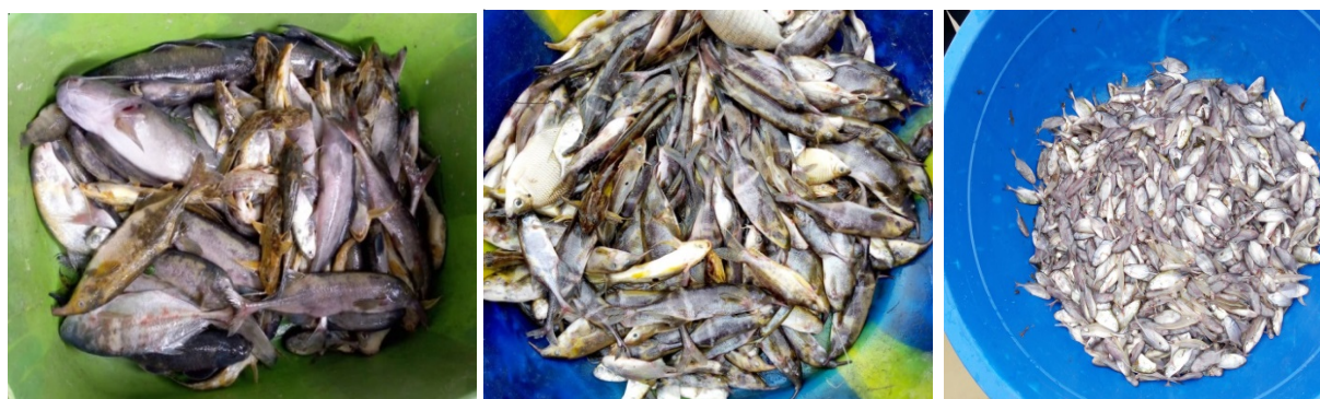
Figures 3; 4 and 5: Mormyridae catches at Kinsuka and Kinkole sites

To supplement their income and meet their social and economic needs, 42.9% of the fishermen resort to complementary activities (agriculture 11.4%; petty trade 8.6%; masonry and handicrafts 8.4%; carpentry 1.4%; whaleboat construction 2.8%; making of fishing nets 1.4%; musical and plastic arts 4.2%; driving 4.7%). But 77.1% of these fishermen confirm that these activities are less profitable than fishing.