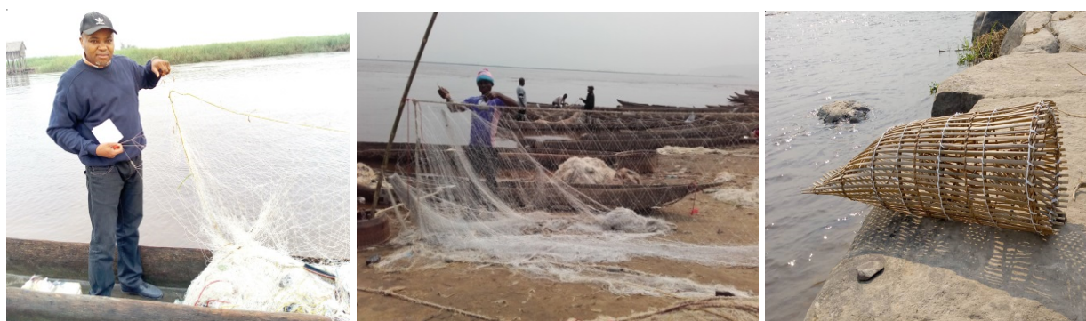
Figure 9; 10 and 11: Trammel nets at Kinkole and Ngamanzo, creel at Kinsuka

Hawk fishing, beach seining, creel fishing and dip net fishing for aquarium fish are each practiced by 5.3% of the fishermen.