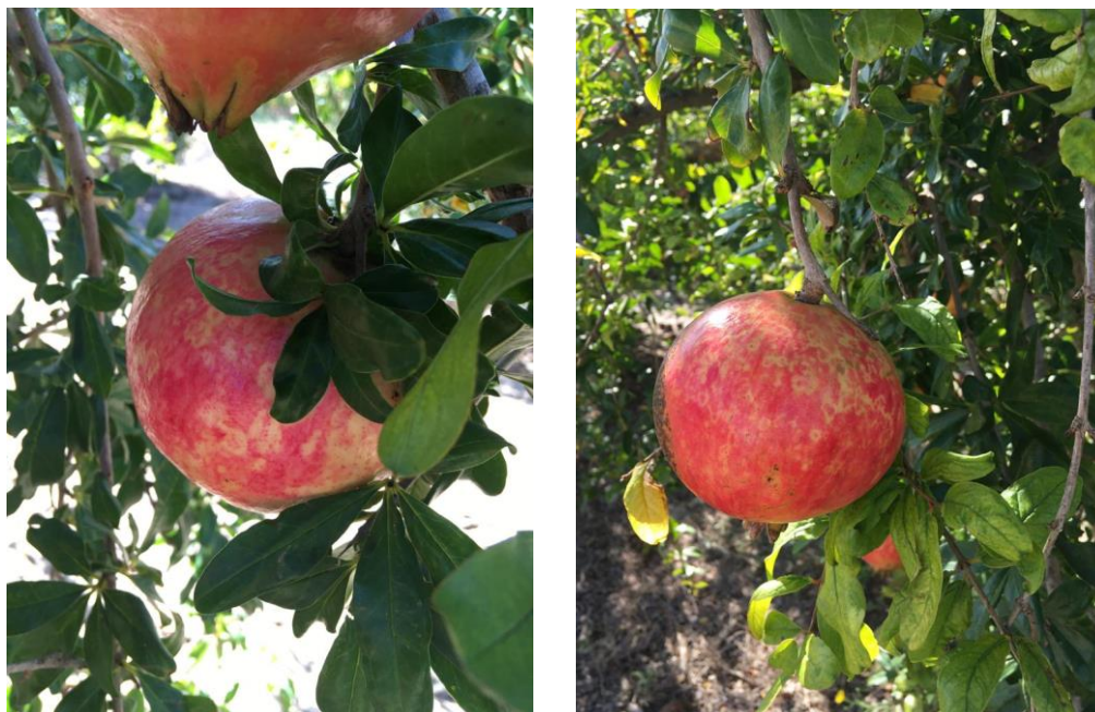
Figure 1. Yellow rings and arabesque discolorations observed on the fruits of the X1 (A) and X2 (B) pomegranate trees (cv. Mollar de Elche).

of species demarcation criteria in viroid taxonomy [6], the current molecular criterion in the Apscaviroid genus is less than 78% nucleotide identity between isolates belonging to different species [5].