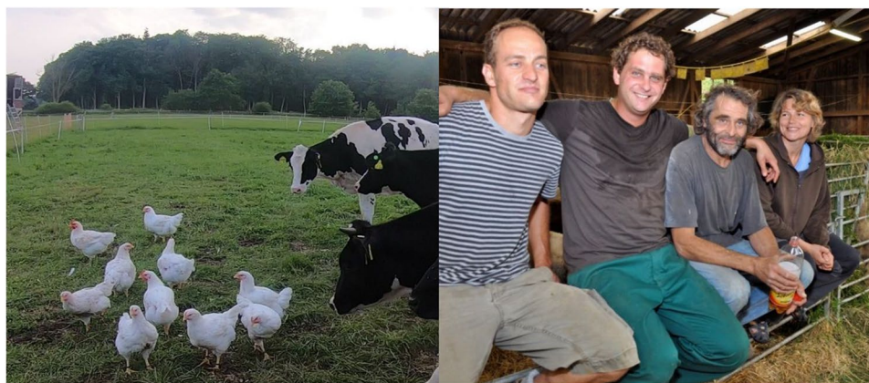
Fig. 1 Co-grazing cattle and broiler chickens (left) as an example of organic mixed-species livestock farming and the workforce of an organic mixed livestock farm (right).

and the number and diversity of OMLF farms in Europe is thus unknown (Ulukan et al. 2021).