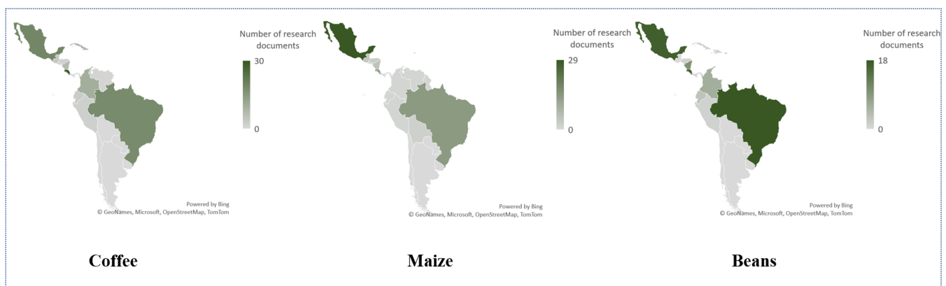
Figure 1. Number and geographical distribution across Latin America of the research documents analyzed for coffee n = 120 , maize n = 99 and beans n = 85 .

We retrieved and reviewed the abstracts of 5233 documents from which we selected 304 documents which we reviewed in depth (Appendix C). As shown by Figure 1, the majority of the research documents were from Brazil and Mexico, followed (especially for beans and coffee) by Costa Rica and Panama.