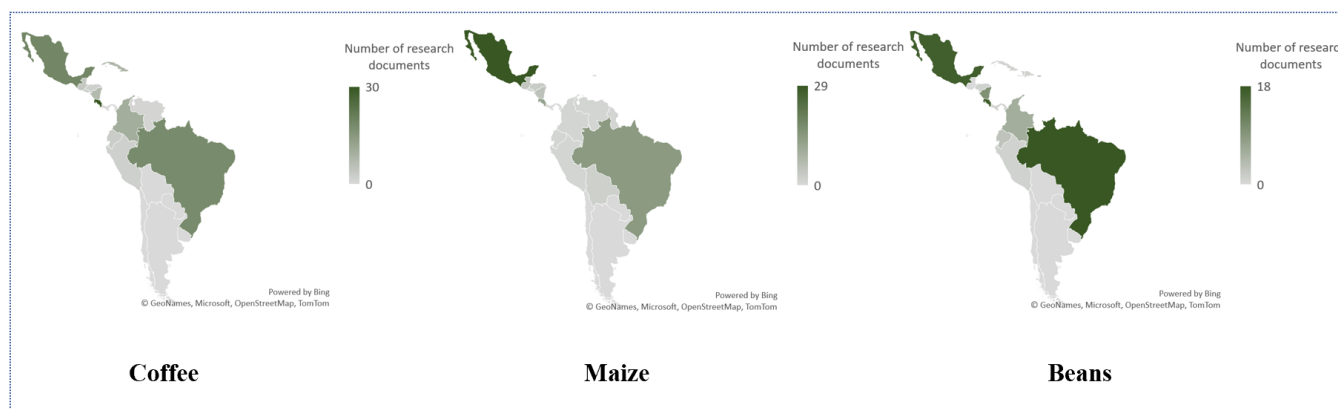
Figure 1. Number and geographical distribution across Latin America of the research documents analyzed for coffee n = 120 , maize n = 99 and beans n = 85 .

We retrieved and reviewed the abstracts of 5233 documents from which we selected 304 documents which we reviewed in depth (Appendix C). As shown by Figure 1, the majority of the research documents were from Brazil and Mexico, followed (especially for beans and coffee) by Costa Rica and Panama.