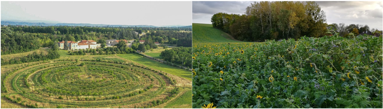
Fig. 1 Agroecological landscapes with (left) several fruit tree species combined in a circular orchard and (right) a mixture of species in a cover crop at the edge of a wood.