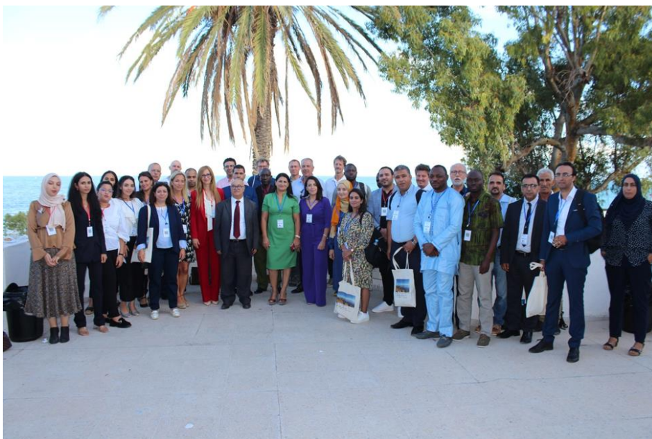
Figure 1: Group photo of workshop participants at INSTM premises, Carthage Tunisia

Based on the above background, the 1st Ecohydrology workshop in North Africa (ECOTUN 2022) “Towards a North African Ecohydrology Demosite” was held between 4 th and 7 th , October 2022 in Carthage, Tunisia (Figure 1).