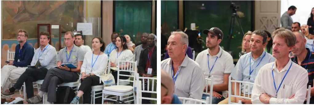
Figure 2: Photos of participants listening to the opening speech from the guest of honor