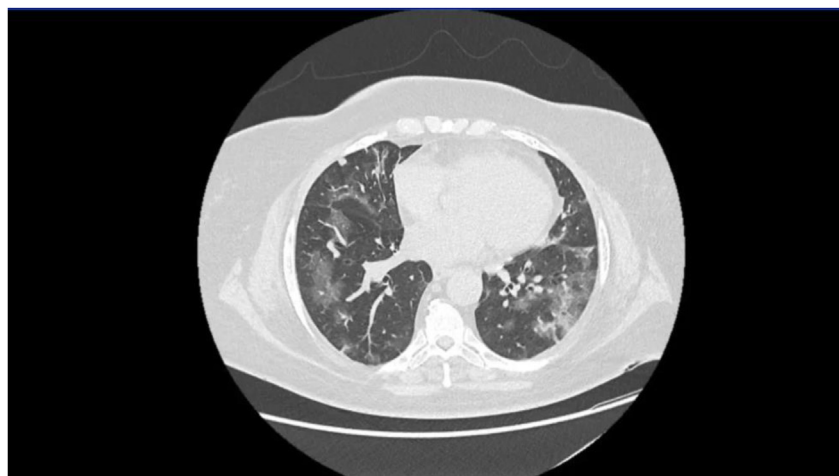
Fig. 1. Typical Covid CT scan.

Continuous data were expressed as mean and standard-deviation, or median and interquartile range, according to their statistical distribution. The assumption of normality was assessed with the Shapiro–Wilk test. Demographic and scanographic characteristics and muscular and adipose characteristics were compared between conventional hospitalization and intensive care groups. The comparisons between groups were performed using Chi-squared or Fisher's exact tests for categorical variables whereas Student t-test or the Mann–Whitney test, when assumptions