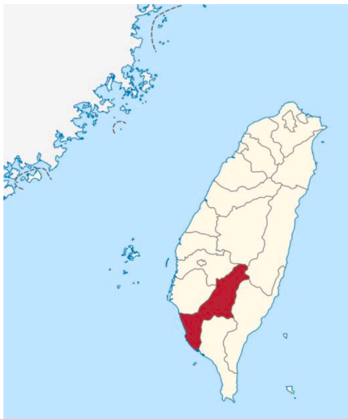
Fig. 6. Map of Kaohsiung (Source: TUBS, CC BY-SA 3.0, via Wikimedia Commons).