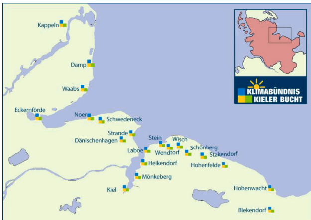
Fig. 3. Map of Kiel Hub with the town of Eckernförde.

of crops and vegetables for local consumption and food sovereignty. Recent national policy ( Loi d'Avenir on Agriculture and Food: 2014, and the strategic plan for the agro-ecological transition in Guadeloupe carried by the Territorial Collectively and acted upon in November 2020 ) is supporting diversification towards multifunctional agriculture, focusing on small-scale family farming as a possible vector for agricultural development in light of the challenges of the 21st century, such as adaptation to climate change, food sovereignty, agro-ecological and bio-economic transition. In addition, grass root initiatives promoting small-scale farming/urban gardening are currently spreading over the islands. This could open up new, fairer opportunities for agricultural production and consumption for the Creole and non-Creole population in the French West Indies under the changes new climate regime dictating to seasonality, timing and volume of rainfall.