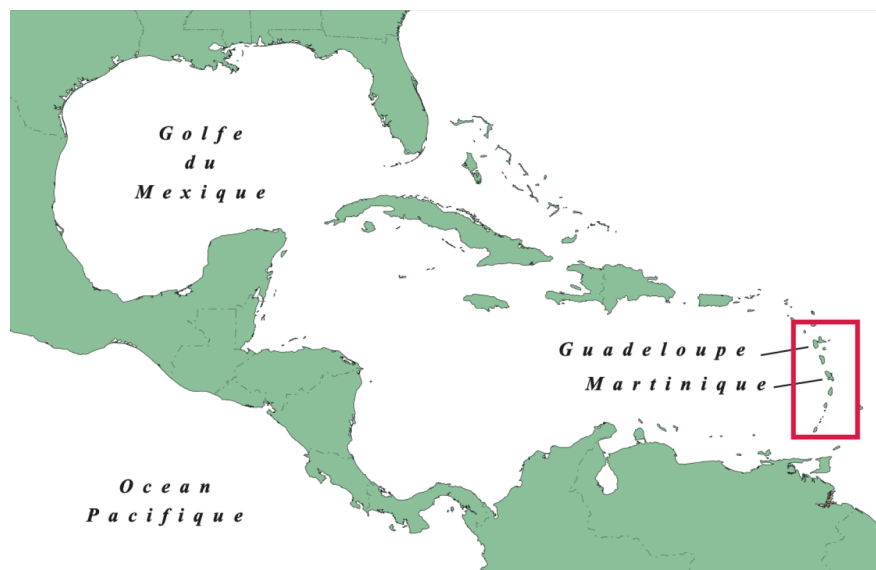
Fig. 5. Map of FWI.

The crucial role which state and public administration plays in all cases is evident although the extent to which administrations are taking actions seems to depend on a variety of factors. In the case of the