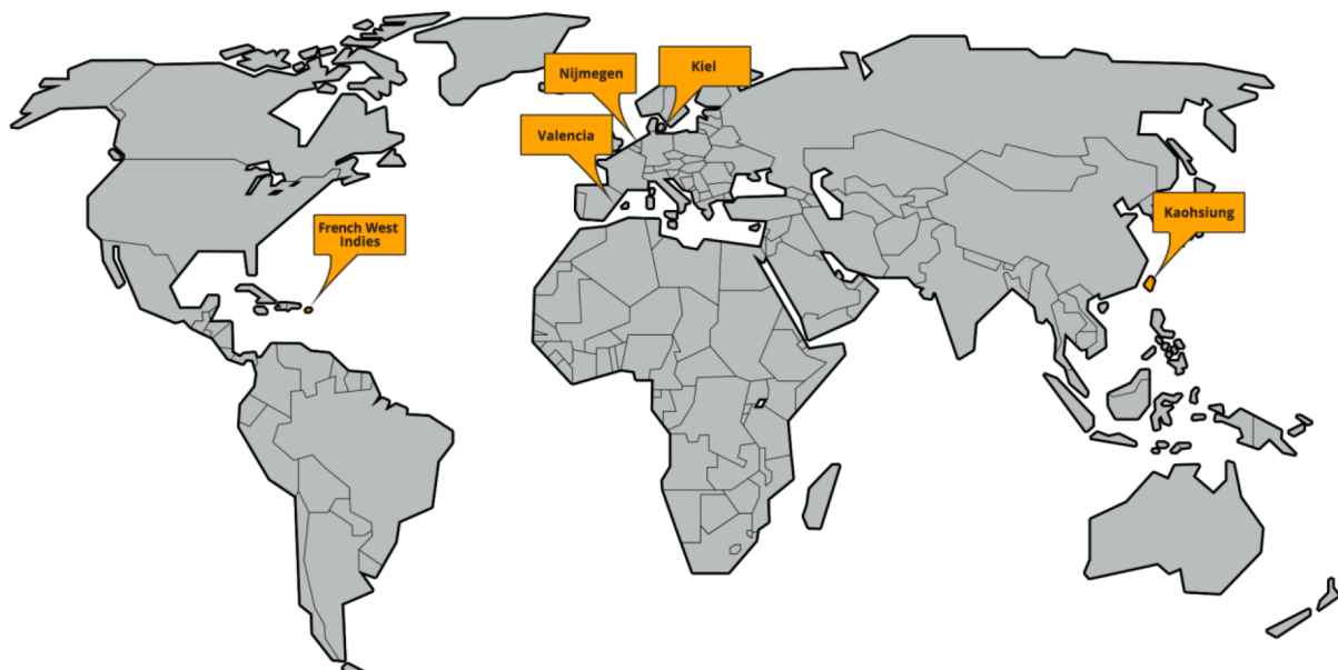
Fig. 1. Location of Hubs.

The Valencia Region is located in a territory very vulnerable to climate change. Some of the main risks associated with climate change are general increase in temperatures, decrease in rainfall, aridification of the territory, rise in sea-level, emergence of new invasive species and new diseases and increased intensity of extreme events like heat waves and droughts (GVA, 2018). Sea-level raise and marine intrusion to the La Plana de València aquifer are also perceived as risks for agriculture located in the coast. The quality of the raw water is also affected by