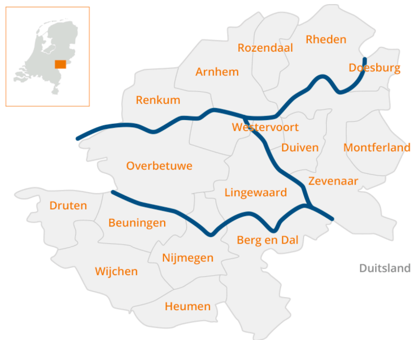
Fig. 2. Map of Nijmegen and its regional area.