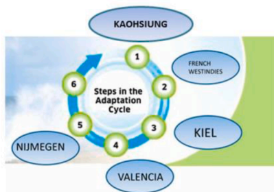
Fig. 7. Five-hubs-in-adaptation-cycle-diagram.