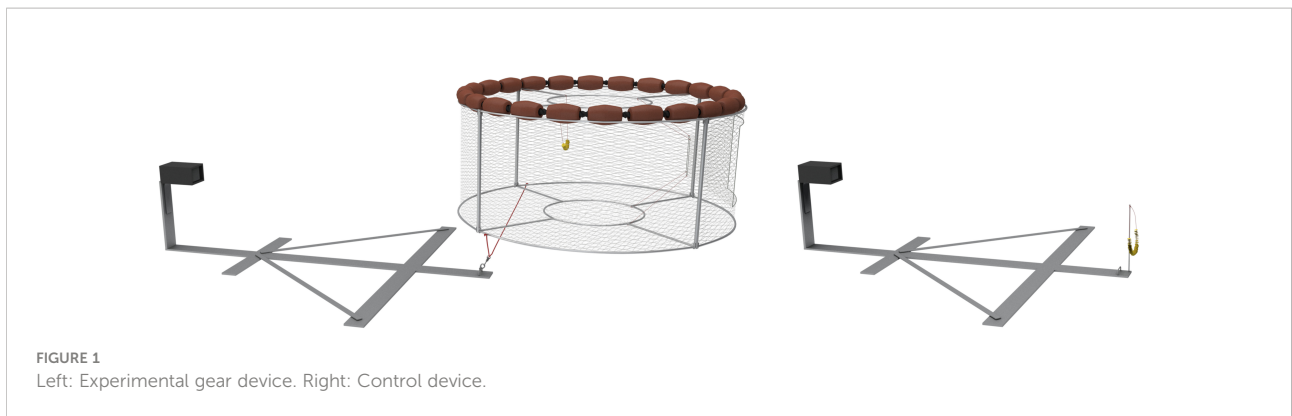
FIGURE 1 Left: Experimental gear device. Right: Control device.

current direction (Furevik and Løkkeborg, 1994). Fish being attracted by odor plume (Løkkeborg, 1998), most of their approaches to the bait is likely to be up-stream. Furthermore, floating the pot avoids the catch of crustaceans such as red king crab ( Paralithodes camtschaticus ) and allows targeting fish species exclusively (Furevik et al., 2008). This characteristic supports the regional legislation, which prohibits the catch of crustacean while using fish pots (CRPMEM Bretagne, 2018). This experiment aims to comply with that legislation. The floated gear was thus linked up to the metal frame using a swivel 40cm above the sea floor, allowing for gyration, whereas