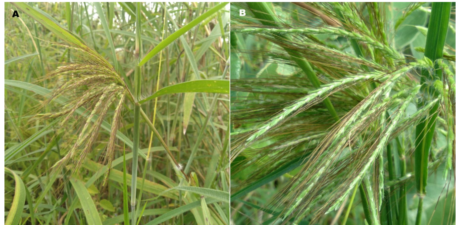
Fig 1. Euclasta condylotricha Steud harvested in Benin. A: The whole plant with stem, leaves and flowers. B: Areal part of the plant showing the flowers.

https://doi.org/10.1371/journal.pone.0278834.g001