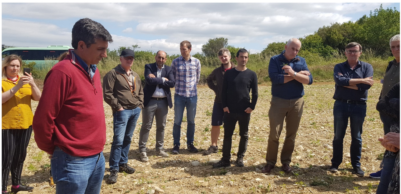
Field visit in the Spanish Living Lab in Navarra, where farmers discuss their experiences with the early warning system for integrated pest management.

Living Labs require significant resources and a nascent group of dedicated actors, so are best used for complex challenges which require the interaction and knowledge of multiple actors to address a given policy objective. There are three distinct but interconnected aspects to consider when assessing the complexity. The first aspect is the level of agreement between the actors involved about the direction of development. For example, in the Dutch Living Lab the challenge was complex because some stakeholders thought maize production could continue unchanged, while others saw a necessity to develop new practices. In response the actors in the Living Lab developed a practical procedure for water sampling at farm level, as an advisory