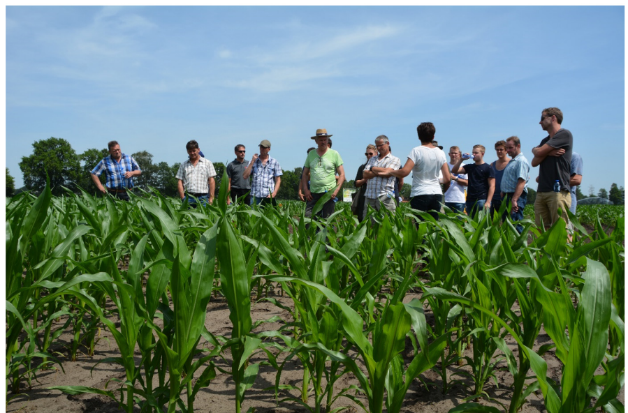
Field visit in the Dutch/Belgian Living Lab, where farmers compare the performance of different systems for maize cultivation.

should only be done when the cost of failure is acceptable, when there is room for unanticipated outputs arising from the co-creation process, and when stakeholders or partner projects are willing and able to provide the necessary commitment. If these conditions are not met or are largely absent, time and effort is needed to create more supportive circumstances, or there should be serious questions asked about whether to start a Living Lab at all. Policymakers can play a crucial role in creating a more enabling setting by ensuring inclusiveness, creating spaces for dialogue, and securing funding or creating funding procedures which do not require predetermination of all outputs in detail. Further, it helps if policymakers coordinate action and agree on clear long-term policy directions to reach societal objectives. If not already in place a Living Lab can provide a space for the dialogue between policymakers and other involved actors about the policy direction, and to coordinate action. In AgriLink the Spanish publicly funded advisory organisation in Navarra provided an enabling setting for the Living Lab and facilitated the adoption of the lessons learned in the AKIS. By working closely with Living Labs, policymakers can take an enabling role in adapting regulations, creating instruments, or support capacity building and training that will help scale-up and deploy the innovations that have been developed in the Living Labs.