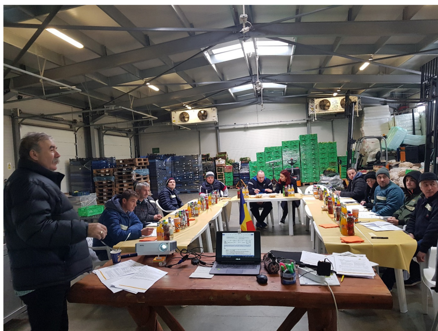
Living Lab event in Romania, where the members of a farmers' cooperative discuss fiscal and financial information needs with fiscal advisors

Another key contribution of AgriLink Living Labs to the development of the AKIS stems from new collaborative practices. For each sustainability challenge the most relevant farmers,