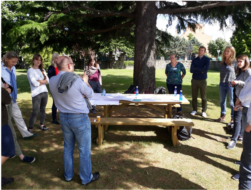
Reflection session between different Living Labs, where facilitators and monitors explore and discuss the conditions that influence the functioning of their Living Lab.

tool to create awareness of a farmer's own influence on water quality. Second, complexity stems from differences in ideas about viable solutions or the criteria to assess the solutions. Third, complexity can also originate from a gap or friction between the challenge in the Lab and the private interest of the end users, as already noted in the example of the Norwegian Living Lab. These are more complex challenges than solving an individual farmer's technical problem.