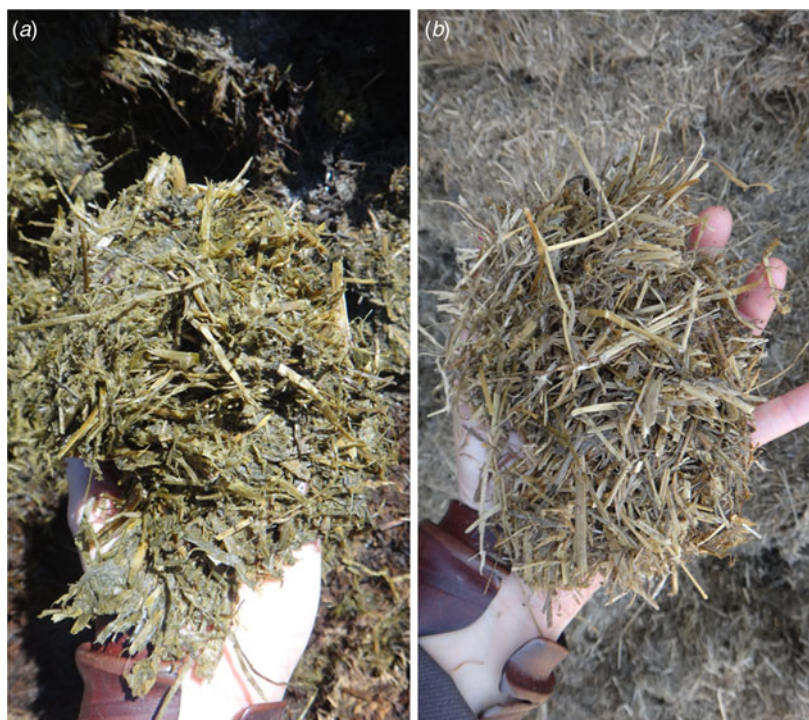
Fig. 3. Observation of two batches of grass silage fed during an outbreak of type D/C botulism in a Holstein dairy herd in Western France in spring 2015. The silage A was harvested in September 2015 and the silage B in May 2014.

be contaminated with type D/C C. botulinum spores in the absence of pasture fertilization with poultry litter, and that poultry litter may be at risk even with proper management of poultry carcasses.