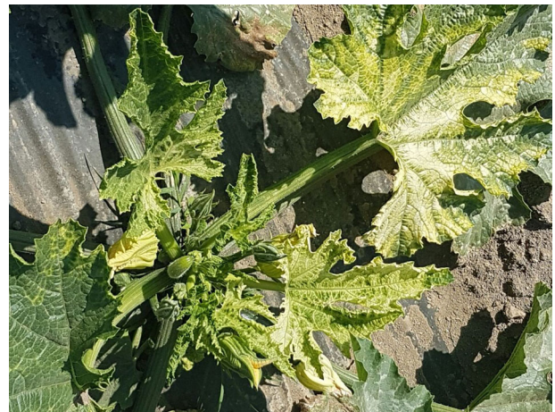
FIGURE 1 Courgette plant showing yellowing symptoms found to be infected with Pepo aphid-borne yellows virus and Tomato leaf curl New Delhi virus

The samples were also checked for polerovirus infection by RT-PCR as follows. Total RNA was extracted from infected tissues using TRI-reagent (Sigma-Aldrich, USA) and RT-PCR was performed with polerovirus primers Pol-G-F and Pol-G-R (Knierim et al., 2014). A 1.1 Kb fragment was obtained from two samples, one sampled in 2019 and the other in 2022. These amplicons were sent to Genoscreen (Lille, France) for direct sequencing. The sequences obtained (GenBank Accession Nos. OP156930 and OP973153, respectively), encompassing part of the polerovirus RNA-dependent RNA polymerase, intergenic region, coat protein and movement protein, shared a close relationship with Pepo aphid-borne yellows virus (PABYV) iso-