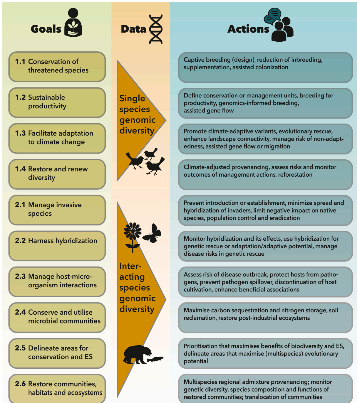
Fig. 2. The value of genomic diversity knowledge for biodiversity and ecosystem services management goals and associated management actions. Management actions can be connected to multiple management goals (see text).

The keyword search suggested limited power for a systematic literature extraction; we thus defined our literature search in consultation with natural resource managers. Based on our framework (Fig. 1), we developed a list of management goals (MGs) in ecosystems that derive from natural biodiversity (Fig. 2). We selected review papers and case studies pertaining to each MG, structured into the categories ‘Single species genomic diversity’ or ‘Interacting species genomic diversity’ to illustrate how management actions (MAs, in bold in the text) for these MGs benefit from genomic data on a single species, or on multiple interacting species (Fig. 2). We are conscious that some MGs are overlapping (Fig. 2) but list them separately on purpose to enhance their accessibility to natural resource managers. When possible, we preferred