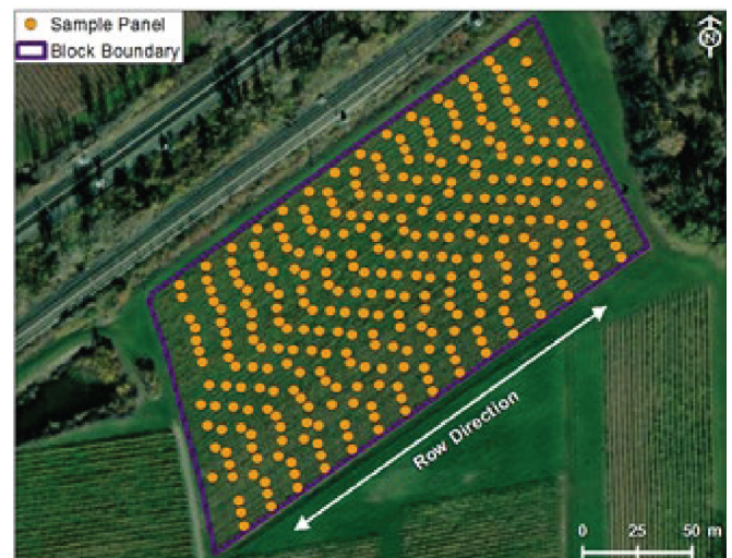
Figure 1 Location of the midpoint of the sampled panels within the 2.6 ha study block at the Cornell Lake Erie Research and Extension Laboratory, Portland, NY.

In May 2019 and 2020 and June 2021, the vineyard was surveyed with a DualEM 1s sensor (DUALEM Inc.) mounted on a PVC pipe-based sled and towed behind an all-terrain vehicle (ATV). The sensor travelled along the center of every second interrow (~1.35 m from the line of the vine trunks and their supporting wires). EC_a was recorded at two depths of ~0.5 m and ~1.6 m (shallow and deep, respectively). Sensor data were recorded with a GeoSCOUT X field data logger with an internal GPS receiver (Holland Scientific). The high-resolution soil maps in all years were very similar ( r > 0.95 , data not shown), which was expected because the vineyard is in a cool-climate region and in spring (May/June), the soil is typically near field capacity following high precipitation from snowfall, with little evapotranspiration over the winter months. Therefore, if the data are correctly collected, the maps should reflect stable textural differences across the block.