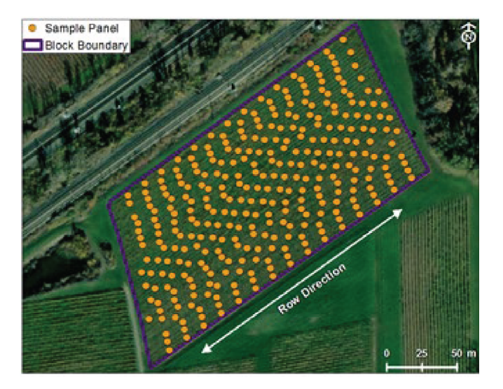
Figure 1 Location of the midpoint of the sampled panels within the 2.6 ha study block at the Cornell Lake Erie Research and Extension Laboratory, Portland, NY.

In May 2019 and 2020 and June 2021, the vineyard was surveyed with a DualEM 1s sensor (DUALEM Inc.) mounted on a PVC pipe-based sled and towed behind an all-terrain vehicle (ATV). The sensor travelled along the center of every second interrow (~1.35 m from the line of the vine trunks and their supporting wires). ECa was recorded at two depths of ~0.5 m and ~1.6 m (shallow and deep, respectively). Sensor data were recorded with a GeoSCOUT X field data logger with an internal GPS receiver (Holland Scientific). The highresolution soil maps in all years were very similar (r > 0.95, data not shown), which was expected because the vineyard is in a cool-climate region and in spring (May/June), the soil is typically near field capacity following high precipitation from snowfall, with little evapotranspiration over the winter months. Therefore, if the data are correctly collected, the maps should reflect stable textural differences across the block.