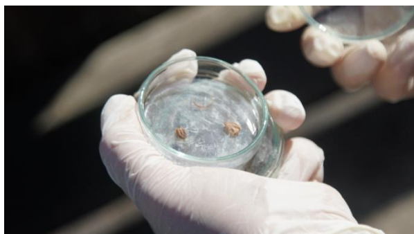
Picture 5. Prospecting for pathogenic fungi