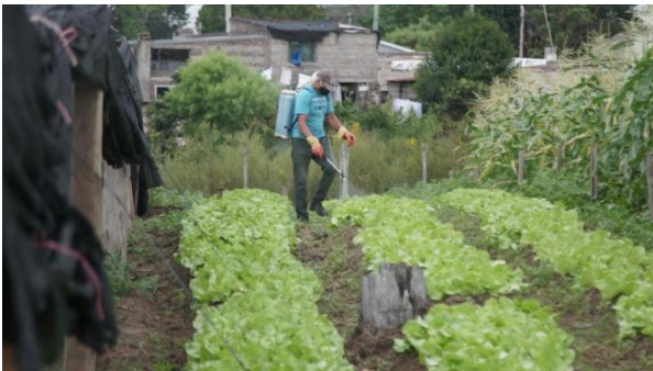
Picture 1. Agroecological vegetable producer in Tacuarembó