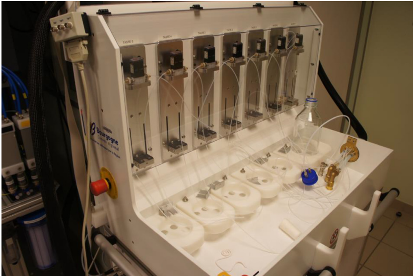
Fig. 1. gustometer model Burghart GU002.

Fig. 1 shows a picture of the gustometer.