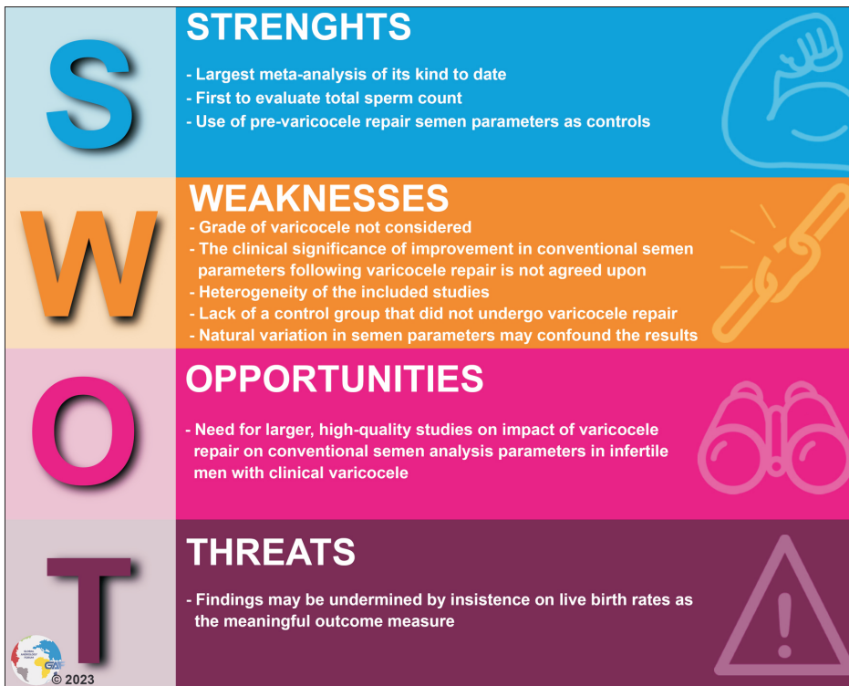
Fig. 2. Strengths, Weaknesses, Opportunities and Threats (SWOT) Analysis.

the control group. This approach has some drawbacks in terms of statistical methodology [381], potential of the placebo effect, non-blindness of the type of intervention e.g. , varicocelectomy, and it also lacks a control arm of patients that did not undergo varicocele repair. A proper control group is a key in establishing a cause-and-effect relationship of a certain variable [382] and testing the impact of an intervention on the outcome. However, this before-after analysis has the advantage of including all intervention groups, thus minimizing the number of studies excluded because of deficient data and increasing the number of patients available for analysis. The quality of the majority of the studies included in this meta-analysis is considered low due to factors such as poor study design, inadequate sample size, selective reporting, or high attrition bias (Table 3, 4). An ideal clinical trial to evaluate the impact of varicocele repair on male fertility outcomes would be to randomize a group of male with subfertility to varicocele repair or sham surgery and follow their outcomes over time. However, many ethical concerns surround such an approach and prevent its implementation. This explains the paucity of high-quality studies on the effects of varicocele repair and male fertility potential. In this regard, a meta-analysis of low-risk-of-bias RCTs would give the best QoE on the impact of varicocele re-