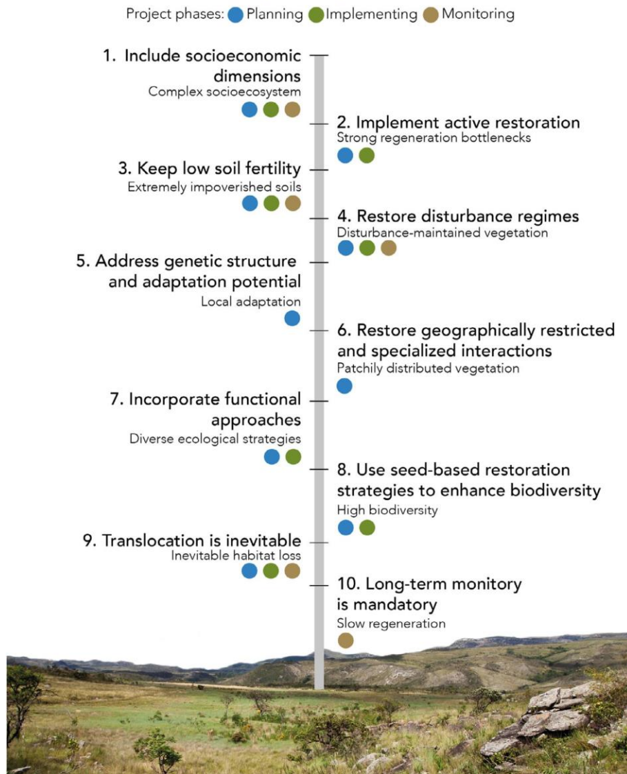
Figure 2. A conceptual framework depicting major challenges and principles to restore campo rupestre vegetation during the phases of planning, implementation, and monitoring.

the available data suggest that poor seed banks and poor seed quality are major bottlenecks for recruitment (Le Stradic et al. 2018). Second, most species lack specialized mechanisms for seed dispersal (Arruda et al. 2021), meaning that seeds have limited capacity to reach areas targeted for restoration. Third, many species are edaphic specialists (Giulietti et al. 2019), meaning that even if their seeds arrive in a target site (e.g. degraded with homogeneous and deeply altered soils), seedlings are unlikely to establish and survive due to narrow edaphic niche breadths. Lastly, even under unlikely events of a successful establishment, seedlings are slow-growing (Dayrell et al. 2018), underscoring a limited capacity to cover bare soils. Thus, regeneration bottlenecks chiefly explain why plant