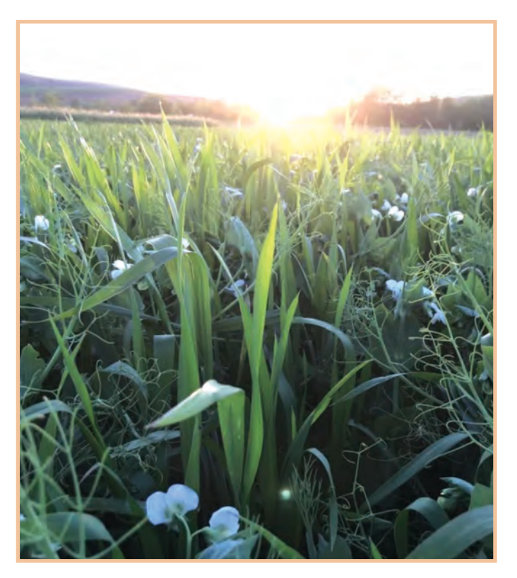
Intercrops pea wheat flower.

The EU is undergoing a fundamental change in the aims for its agriculture and food systems, with a significant emphasis on meeting sustainable goals and reducing reliance on imports from outside Europe. The Horizon 2020 ReMIX research project (N. 727217) collaborated with farmers and additional stakeholders such as agricultural advisors to analyse and optimize the performance of intercropping based on species mixtures, mainly cereals associated with grain legumes, to design productive, diversified, resilient and environmentally friendly cropping systems that are less dependent on external inputs, or more productive in organic farming.