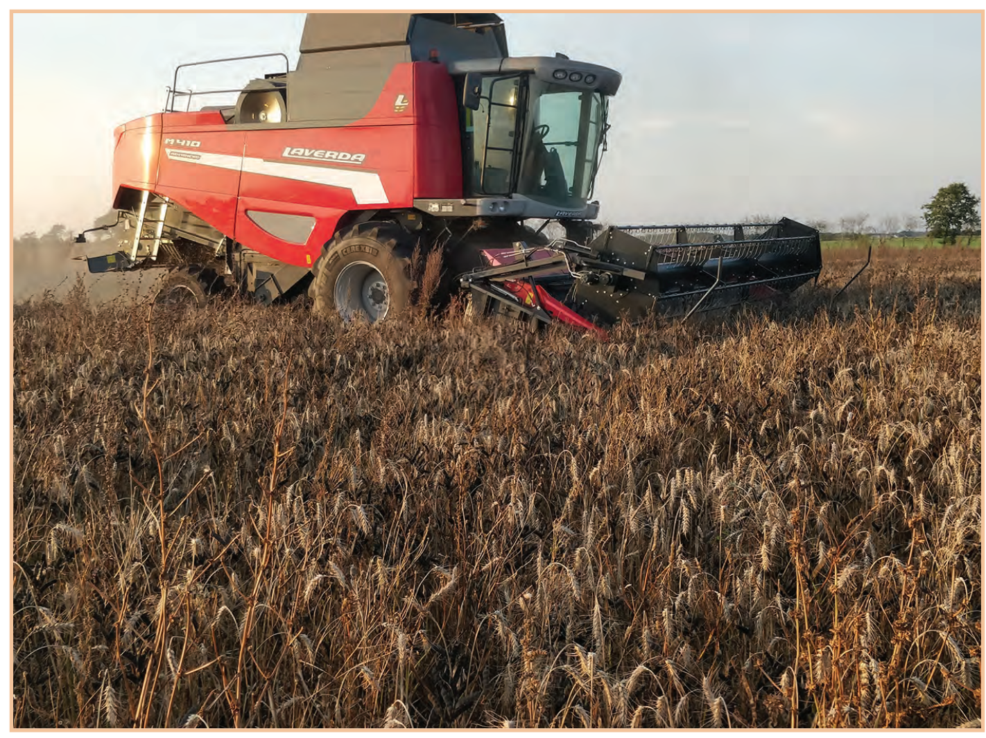
Harvest of a wheat-lupin mixture in Denmark with a Laverda M410 combine harvester from AGCO Group.

Finally, intercropping of cereals and legumes allows improved production of legumes that are very sensitive to pests and diseases and that usually produce low and unstable yields in organic farming: it is a promising way to produce larger types of species and increase the production of grain legumes in Europe.