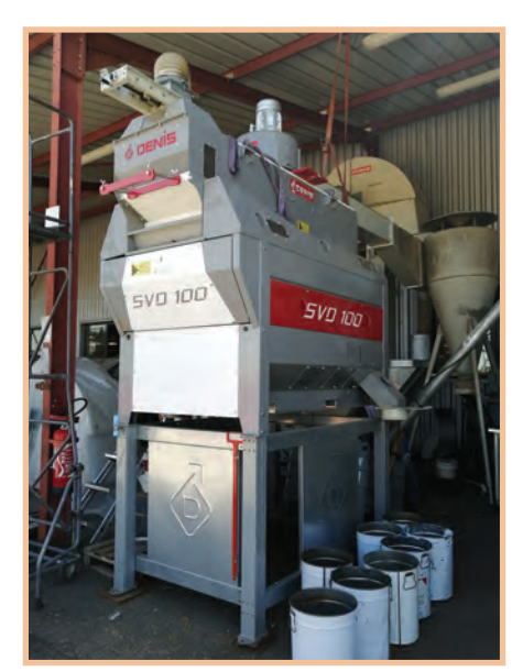
Figure 2 SVD100 vibrating cleaner from Etablissements Denis used to demonstrate the feasibility of the separation of species mixture and the resulting economic benefit