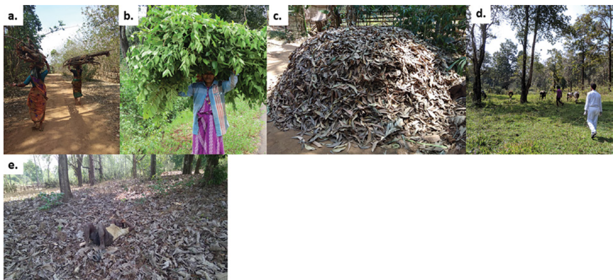
Figure 2. Key activities that pose a high risk of coming into contact with high numbers of ticks and Kyasanur Forest Disease Virus. (a) collecting firewood and (b) leaves from forest where ticks at high density; (c) storage of leaves that may harbour ticks for fertiliser or animal bedding; (d) movement through forests for grazing or collection of Non-timber Forest Products; and (e) resting on forest floor.

The differences in patterns of KFD vulnerability highlight the need for context-specific prioritisation and targeting of interventions. Homogenous labelling of smallholders as 'vulnerable' could compromise or operate to favour certain intervention pathways, which might threaten or worsen the already precarious livelihoods of certain social groups (e.g. tribal forest-dependent households) with weaker bargaining power or influence (Asaaga et al. , 2023). Thus, existing policies banning people from entering forests in response to KFD outbreaks are likely to have very adverse effects on their livelihoods and wellbeing. Any proposed intervention (e.g. forest bans, diversification of livelihood activities) should be relevant to local livelihood contexts and evaluated against potential negative consequences. Policies addressing forest use should also be mindful of the historical conflicts surrounding conservation and forest protection in these regions.