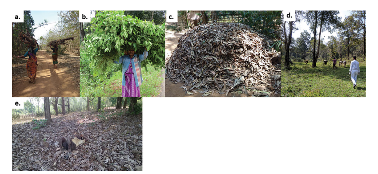
Figure 2. Key activities that pose a high risk of coming into contact with high numbers of ticks and Kyasanur Forest Disease Virus. (a) collecting firewood and (b) leaves from forest where ticks at high density; (c) storage of leaves that may harbour ticks for fertiliser or animal bedding; (d) movement through forests for grazing or collection of Non-timber Forest Products; and (e) resting on forest floor.

The differences in patterns of KFD vulnerability highlight the need for context-specific prioritisation and targeting of interventions. Homogenous labelling of smallholders as 'vulnerable' could compromise or operate to favour certain intervention pathways, which might threaten or worsen the already precarious livelihoods of certain social groups (e.g. tribal forest-dependent households) with weaker bargaining power or influence (Asaaga et al., 2023). Thus, existing policies banning people from entering forests in response to KFD outbreaks are likely to have very adverse effects on their livelihoods and wellbeing. Any proposed intervention (e.g. forest bans, diversification of livelihood activities) should be relevant to local livelihood contexts and evaluated against potential negative consequences. Policies addressing forest use should also be mindful of the historical conflicts surrounding conservation and forest protection in these regions.