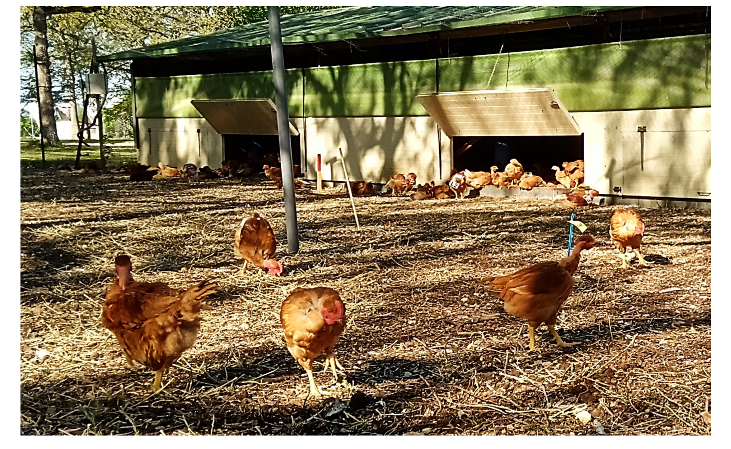
C. Bonnefous, ©INRAE