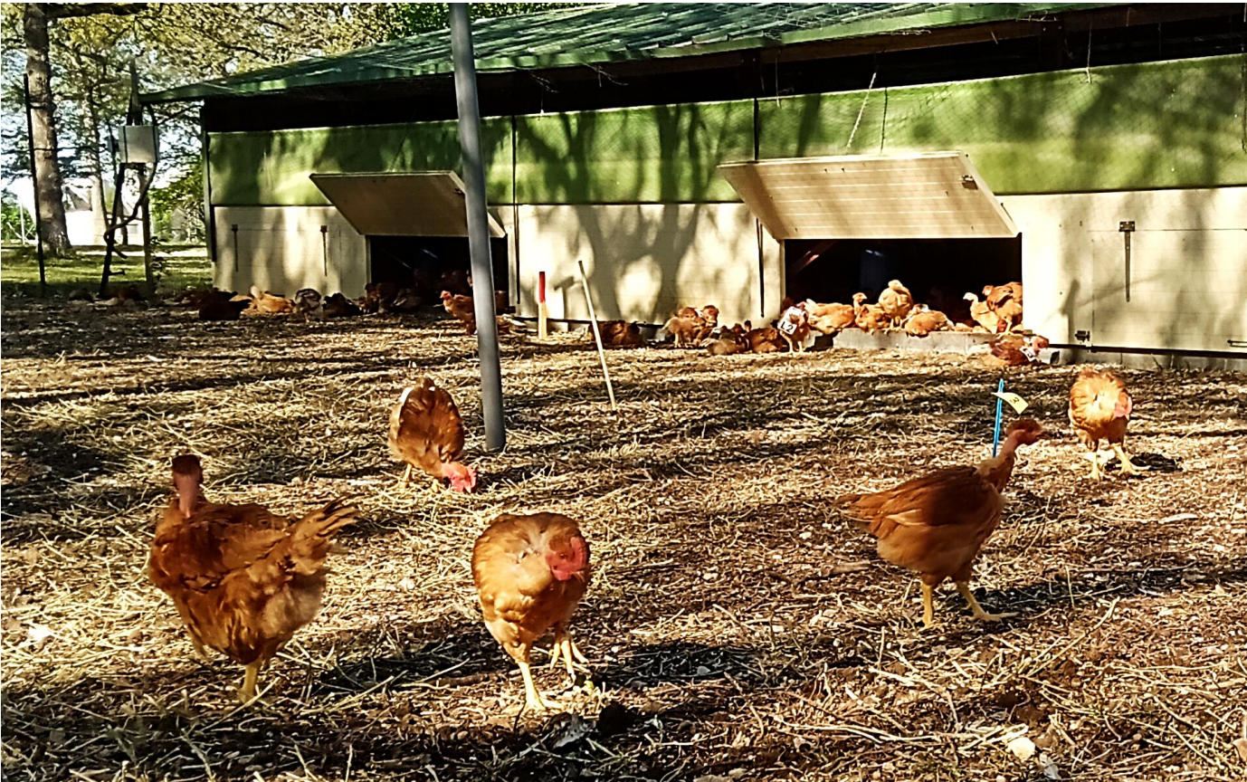
C. Bonnefous, ©INRAE