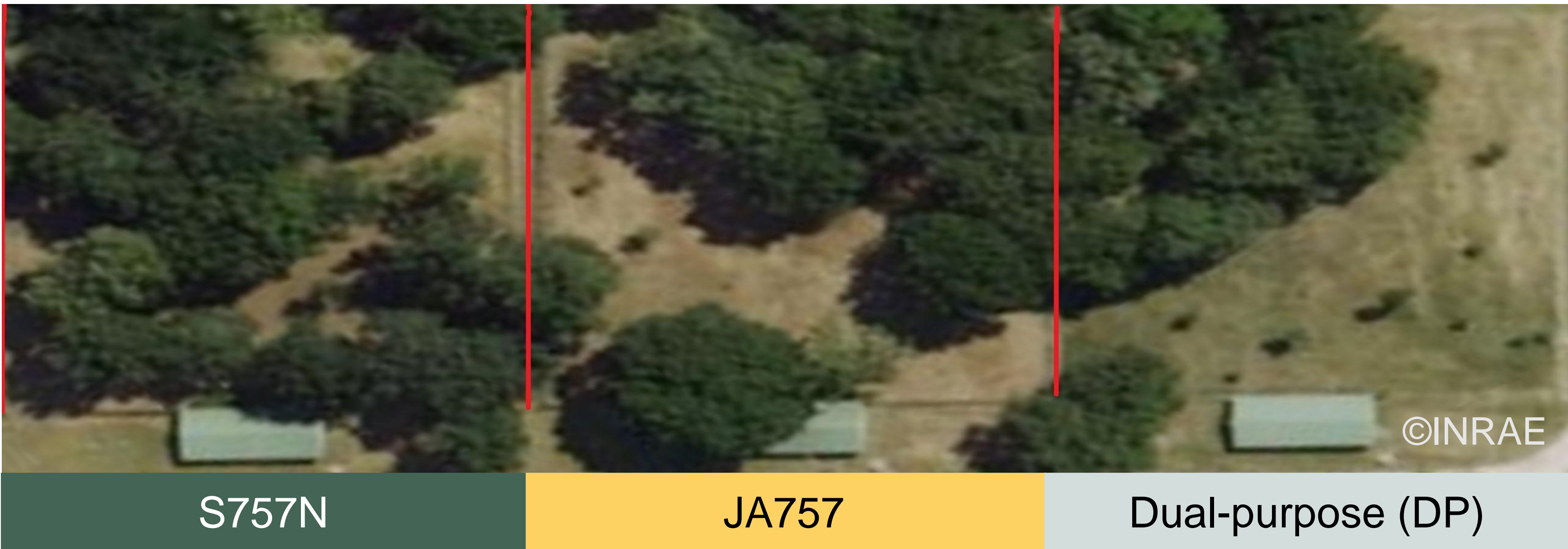
Strains S757N, JA757 and DP of average daily gains of 26 g/d, 36 g/d, and 16 g/d