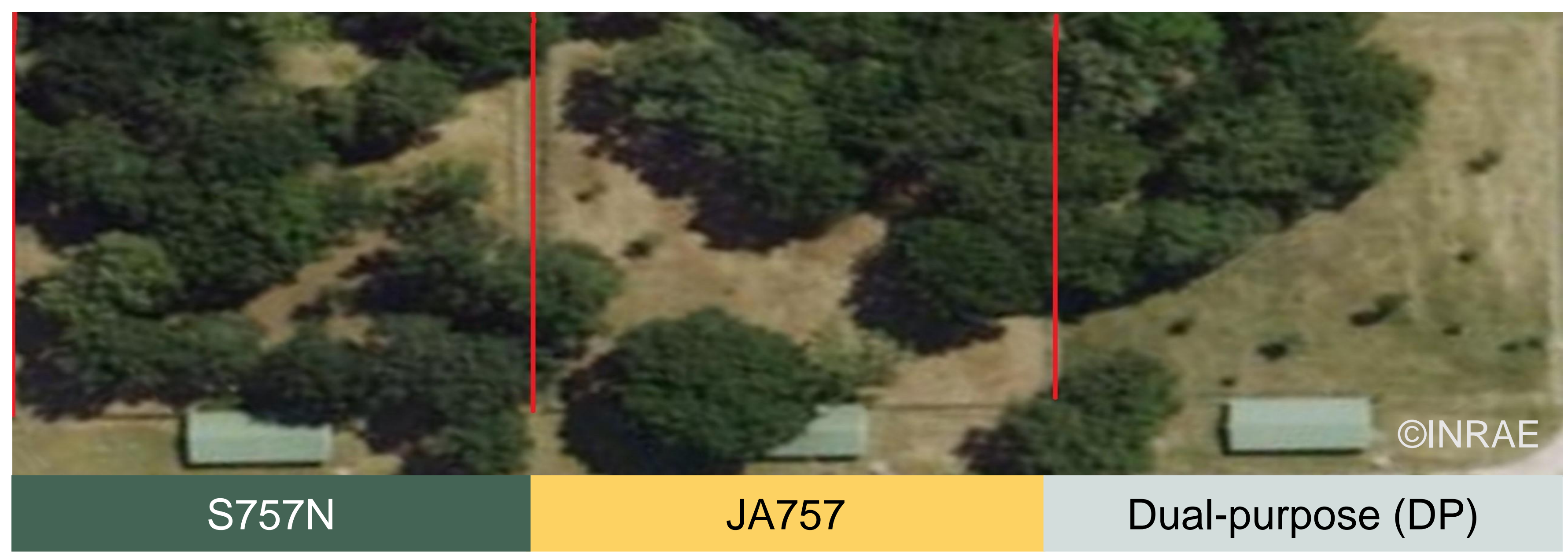
Strains S757N, JA757 and DP of average daily gains of 26 g/d, 36 g/d, and 16 g/d

Radio Frequency Identification (RFID) to evaluate the time spent outdoors: On 100 males and 100 females No range use difference between males and females Projection of time spent outdoors per day on the whole population