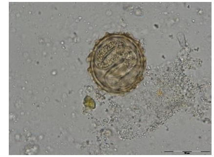
A. suum egg with L 2/3 (larva, 400x)