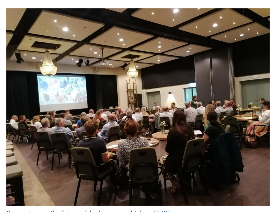
Symposium on the future of dual-purpose chickens @ UU

On June 1st 2023, UU-members of the PPILOW consortium coorganized a symposium on the future prospects of dualpurpose chickens the Netherlands, together with and Fair Poultry Bionext Among the 60 attendees were poultry farmers, policy makers, veterinarians, feed suppliers, and researchers. Rodenburg presented results from the PPILOW project, regarding the characteristics of dual-purpose genotypes (WP 5) and the perception of European consumers on the low-input and organic poultry production (WP 1). In addition, Fair Poultry presented the results of the