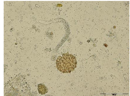
Hatched L 2/3 (larva, 400x)