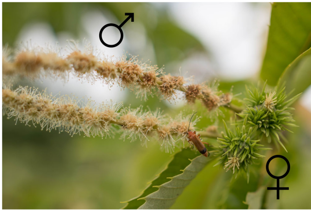
FIGURE 1 Chestnut ( Castanea spp.) bisexual inflorescences. For each of the two bisexual inflorescences visible in the picture, there is a group of three female flowers at the base (with white styles surrounded by green bracts that will produce the spiny bur) and a long male catkin with numerous white stamens. Notice the red soldier beetle ( Rhagonycha fulva ) on the lower bisexual inflorescence.