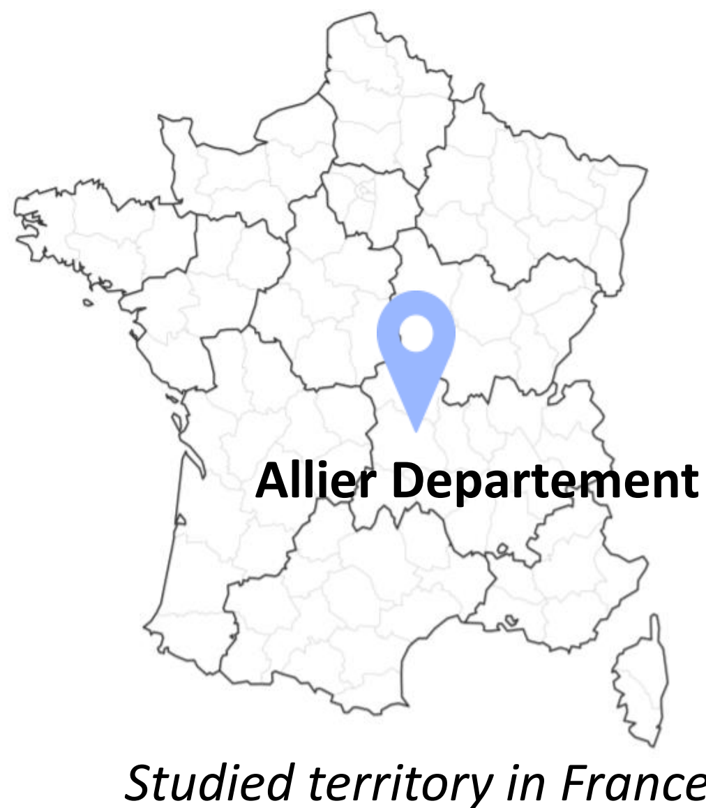
Studied territory in France