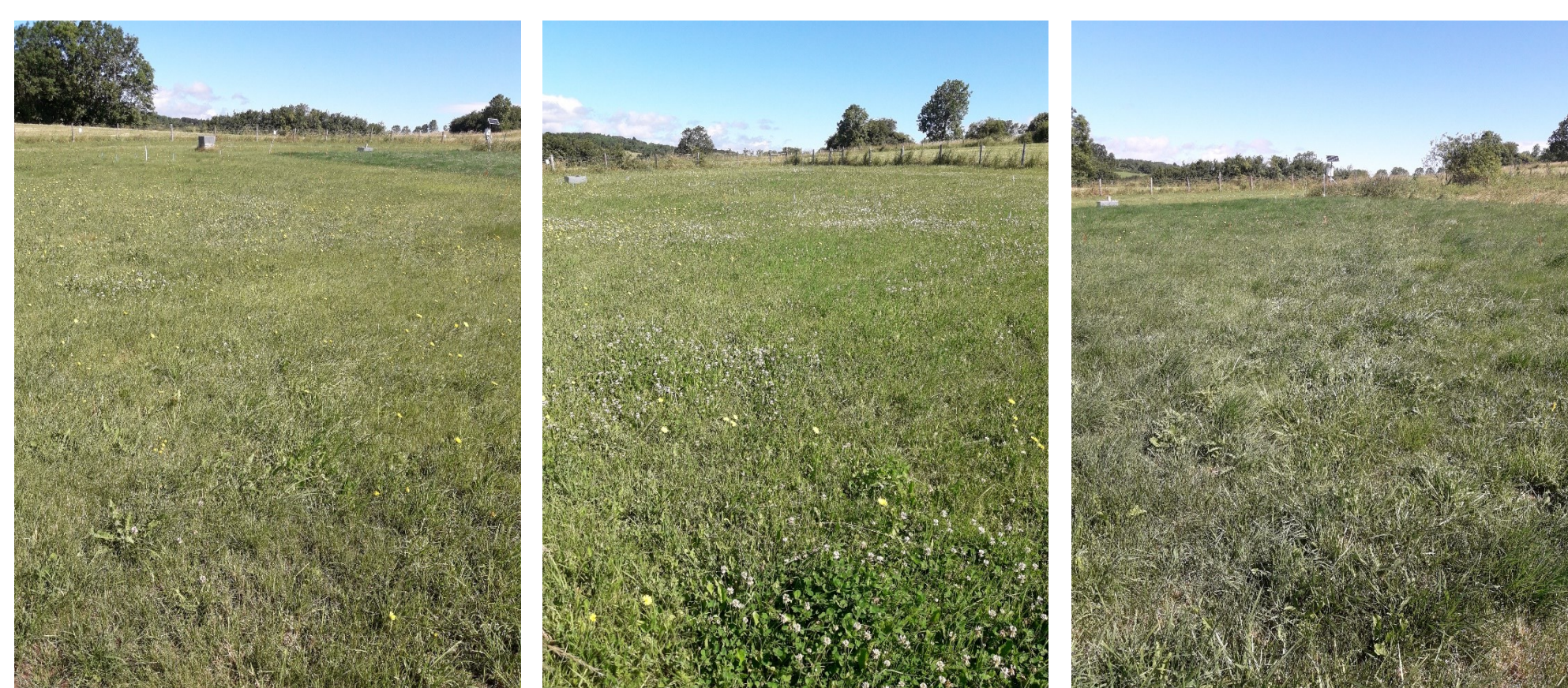
No fertilization Plot 18 PK Plot 19 NPK Plot 20

Experimental fields in June 2020, 15 th year of experimentation, of one of the four repetitions per treatment.