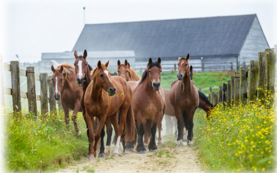
Experimental herd of mares (Jumenterie du Pin IFCE)

From 19/04/2022 to 08/08/2022 42 mares • 33 Warmbloods, 9 Standardbreds • 3-22 years old (M = 13 ± 5,3)