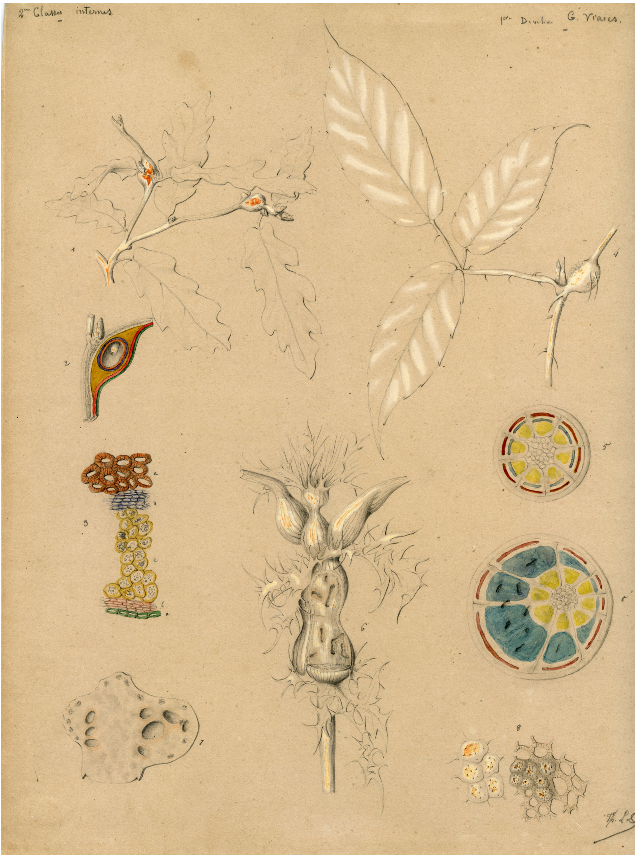
Fig. 2. – Original drawing made by Lacaze-Duthiers representing the galls made by Andricus inflator (1 & 2) a Cynipidae on Quercus sp., Lasioptera rubi (4), a Cecidomyiidae on brambles ( Rubus spp.) and Lasioptera eryngii (6) another Cecidomyiidae on Eryngium campestre . (© Archives Laboratoire Arago/Sorbonne Université).