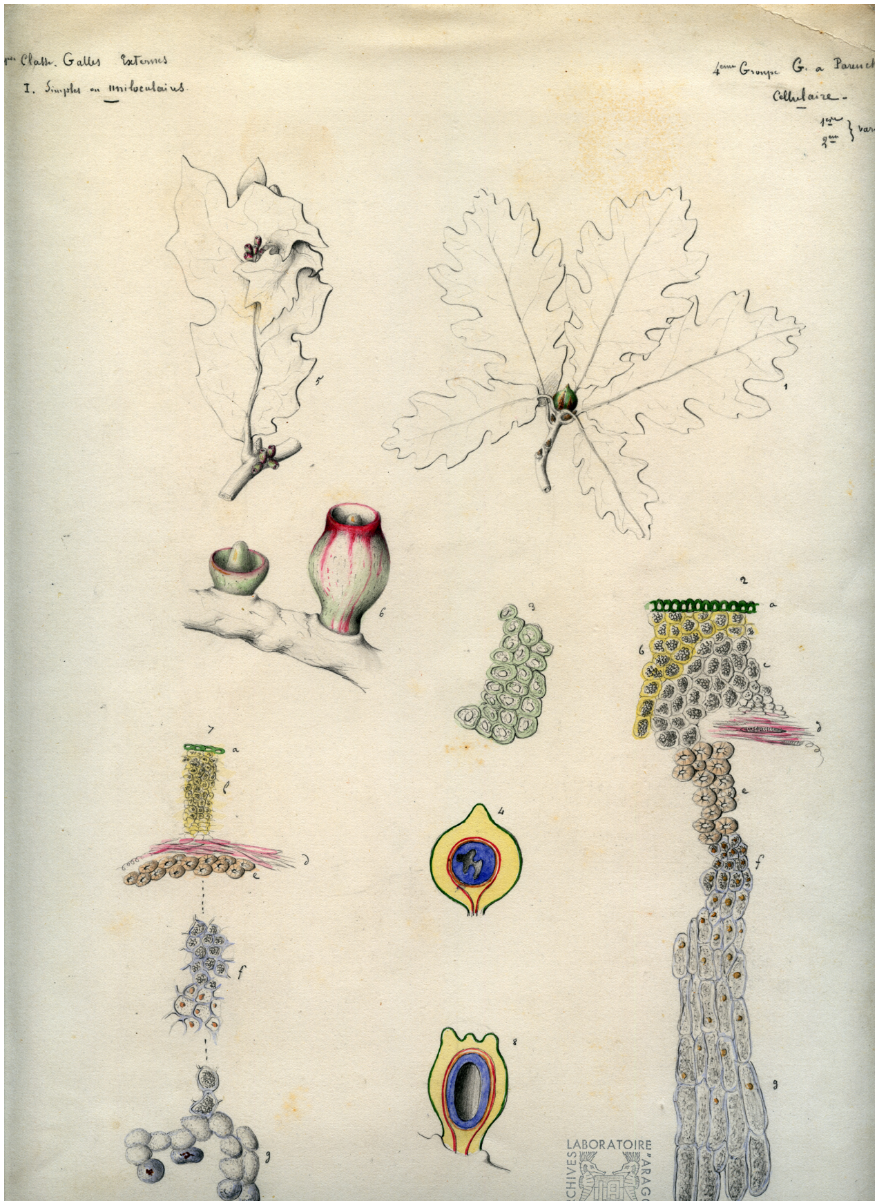
Fig. 1. – Original drawing made by Lacaze-Duthiers representing the gall made by a Cynipid wasp, Andricus inflator on oak trees ( Quercus spp.).