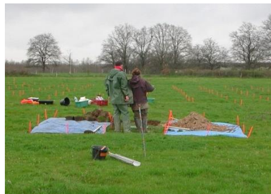
National SMS sampling campaign in France

Several options towards harmonized SMS and LUCAS were discussed and are currently being tested within EJP SOIL WP6 ( Table 1 ). The ambition is to improve the use of the existing data in EU countries and at EU level and also to benefit from the LUCAS campaigns to test harmonization options.