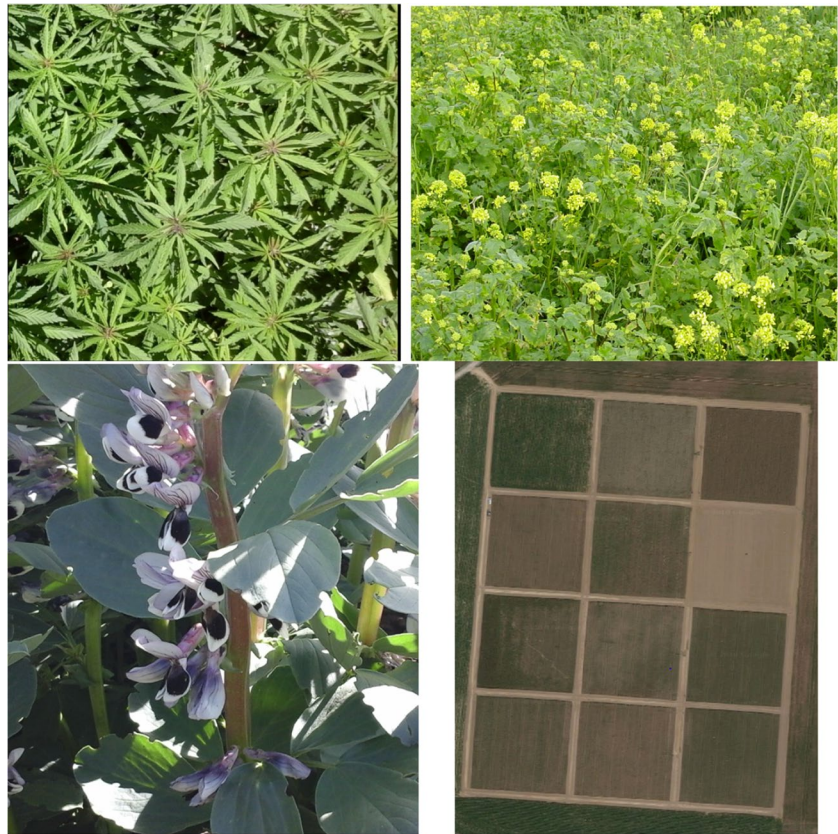
Fig. 1 High crop diversity (hemp, mustard cover crop, spring faba bean) sown within the No-Pesticide system, and the experimental field trial.

cropping systems in the area where the trial is located (the Versailles Plain) and which were used for further comparisons (Table 1).