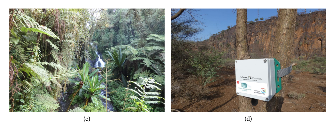
Figure 1: Pictures illustrating the different habitat types in Kenya where the soundscape recordings were collected.

private score of 0.764. There was relatively little 'shake-up' in the results — the top public entry dropped to third, and otherwise the top five maintained their order on the private leaderboard. This stability may be due to better cross-validation practices in recent competitions.