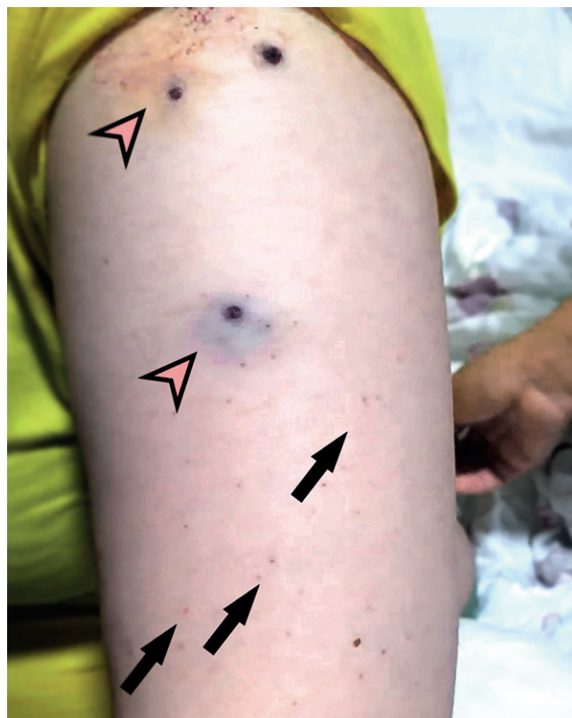
Black arrows point towards petechial bleeding. Arrow heads indicate haematomas caused by the administration of low-molecular-weight heparin and phlebotomy.

Skin lesions of Case 1 of Crimean-Congo haemorrhagic fever on Day 3 after symptom onset, North Macedonia, July 2023