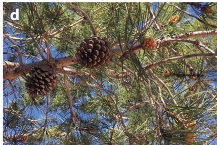
d Level of serotiny signifies capacity to regenerate after fire.