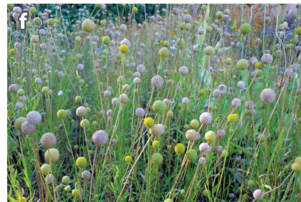
f Variation in seed thickness enables evolution under changing fire regimes.