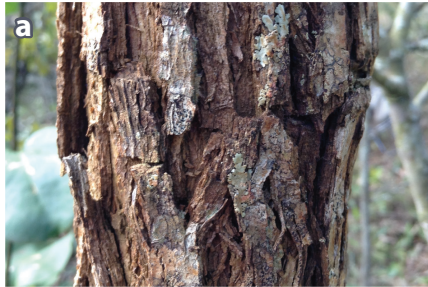
a Bark thickness shapes climate-carbon-fire feedbacks.