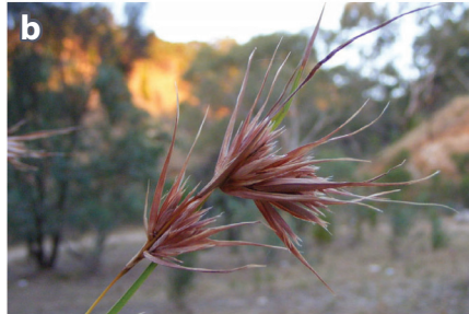
b Underground bud banks predict grass tolerance of fire and herbivory.