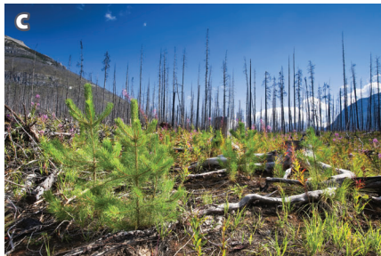
c Time to reproductive maturity informs thresholds below which population declines are expected.