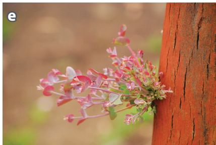
e Resprouting type indicates the pace of habitat recovery.