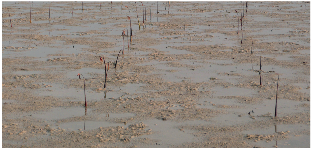
Failed replantation of mangrove species in Saloum delta, Senegal

In Senegal, between 2009 and 2011, the participatory mangrove restoration project “Plant Your Tree”, which aimed at generating carbon credits, failed to properly consider local knowledge and experience or to involve local people in decision-making. Although many villagers were paid to transplant mangrove propagules, they did not participate in the selection of reforestation sites, species or transplanting techniques or period, which are key for the success of replantation. Eventually, they lost their access and use rights over the reforested areas and the replantation failed. Drawing lessons from existing projects and the recommendations of a platform of experts, the French Facility for Global Environment (FFEM) is now promoting in-depth socio-ecological diagnoses in the projects it supports, particularly in Senegal, prior to their implementation.