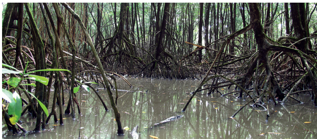
Pristine Rhizophora mangroves in the Lago Piratuba Biological Reserve, Cabo Norte, Amapá, Brazil (credit photo Christophe Proisy, 2011)

In Brazil, around 80% of mangrove forests are located in public protected areas (federal, state or municipal), most of which are defined as extractive reserves, a category of protected area where the conservation of the natural system, and therefore the carbon stock, depends on shared management between public authorities and traditional communities. However, several companies linked to the carbon market have harassed traditional communities living in these areas and violated their rights in a form of land grabbing. In 2022, Confrem – the National Commission for the Strengthening of Extractive Reserves and Coastal Marine Extractive Peoples, which represents most of the traditional communities associated with Brazil's mangroves – published a document calling for prior, free and informed consultation, the guarantee of community protocols and territorial rights for local people.