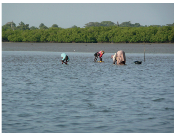
Shell fishing in Saloum Delta, Senegal