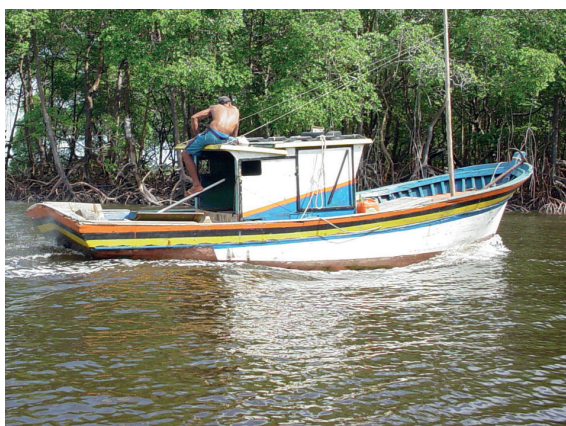
Fisherman in the mangrove of Cassurubá Extractive Reserve, Bahia, Brazil

At the local level, people, thanks to customary modes of governance, have used and preserved blue carbon ecosystems for centuries. This traditional knowledge and know-how must be internationally recognized and inform preservation strategies and frameworks. Progressive ways of collaborative planning are being experimented with the emerging living lab approach. For instance, MAGELLAN, a living lab project on the mangroves of French Guiana, was particularly well received by local stakeholders, who understood that a better knowledge of the complex functioning of mangroves could help address major socio-environmental challenges in French Guiana.