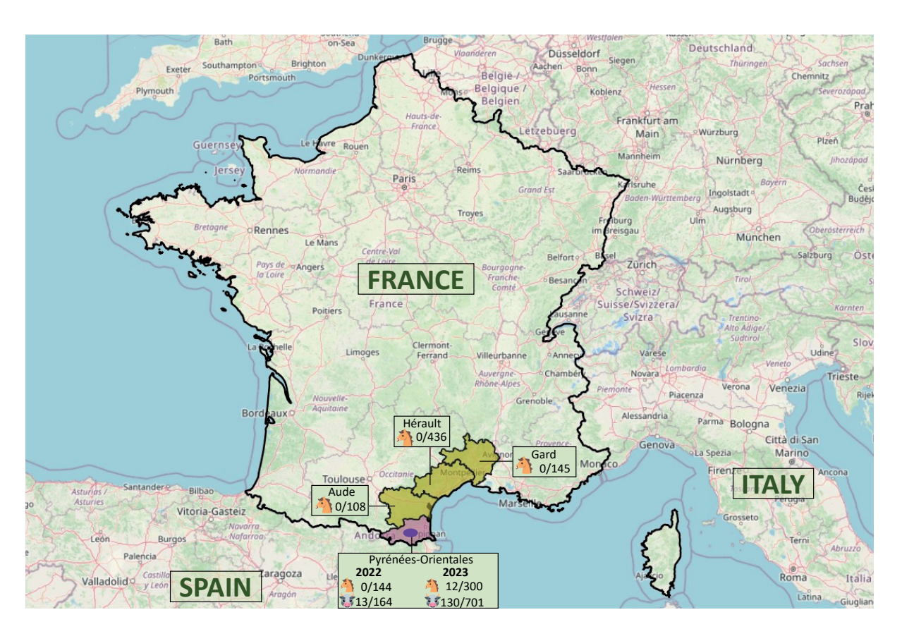
Boxes indicate the name of each department, the animal species (horse or cattle) from which ticks were collected and the number of ticks tested positive for Crimean–Congo haemorrhagic fever virus. The departments coloured green were sampled in 2022 and the one coloured purple was sampled in 2022 and 2023.

Map showing areas where ticks were collected from cattle and horse farms for analysis of Crimean–Congo haemorrhagic fever virus, France, May 2022 and April 2023 (n =57)