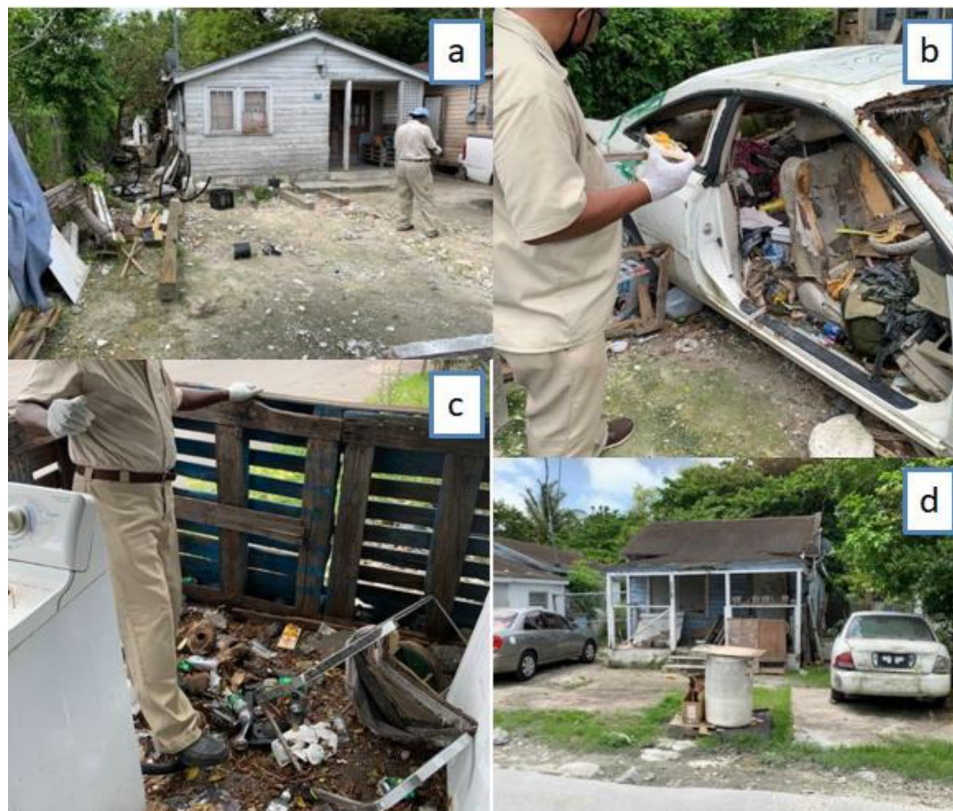
Figure 2. Some of the conditions that may influence rodent population as observed here in the Bahamas during the WHO/PAHO Bahamas rodent surveillance training workshop: (a) residence with construction materials and other debris, (b) residence with a wrecked/abandoned vehicle, (c) residence with an unkempt surrounding, and (d) residence bordering abandoned building and vehicle.

To investigate factors possibly influencing rodent infestation using active rodent signs (i.e. rodent runs, burrows, faecal or gnawed material) as a proxy in the poor urban community under study, 16 variables with p -values of \leq 0.15 from an initial separate analysis were included in the final model (Supplementary Annex III). Of these 16 variables, the final model (Table 2) retained eight (namely: area; residence with unapproved refuse storage; exposed garbage; source of animal food; other sources of food; bulk wastes; construction materials; and residence with structural deficiencies) with an Akaike Information Criterion (AIC) of 345.9, and the model with the fewest number of variables.