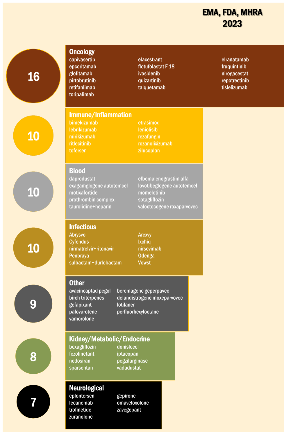
FIGURE 2 New drugs approved in 2023 by the European Medicines Agency (EMA), Food and Drug Administration (FDA) and Medicines and Healthcare Products Regulatory Agency (MHRA), by therapeutic area/category.

reduced the risk of developing RSV-associated LRTD by 82.6% in people 60 years old and older, regardless of RSV subtype or the presence of underlying coexisting conditions. For both vaccines, safety and serious adverse effect profiles were not statistically different than those of placebo.