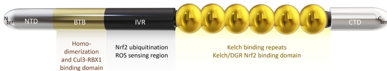
Figure 2. Structure of the protein Keap1. NTD: N-terminal domain; BTB: 2-a broad complex, tram-track, bric-a-brac; IVR: 3-a cysteine-rich intervening region; CTD: C-terminal domain.

Keap1, a dimeric cytoplasmic protein, functions as a major Nrf2 inhibitor (Figure 2). It contains an NTD, a BTB domain for Neh2 interaction, an IVR with an NES for cytoplasmic localization, a DGR with Kelch motifs essential for KEAP1-Nrf2 association, and a CTR [83,94–97]. Keap1's structure and function are crucial in regulating the Nrf2 system.