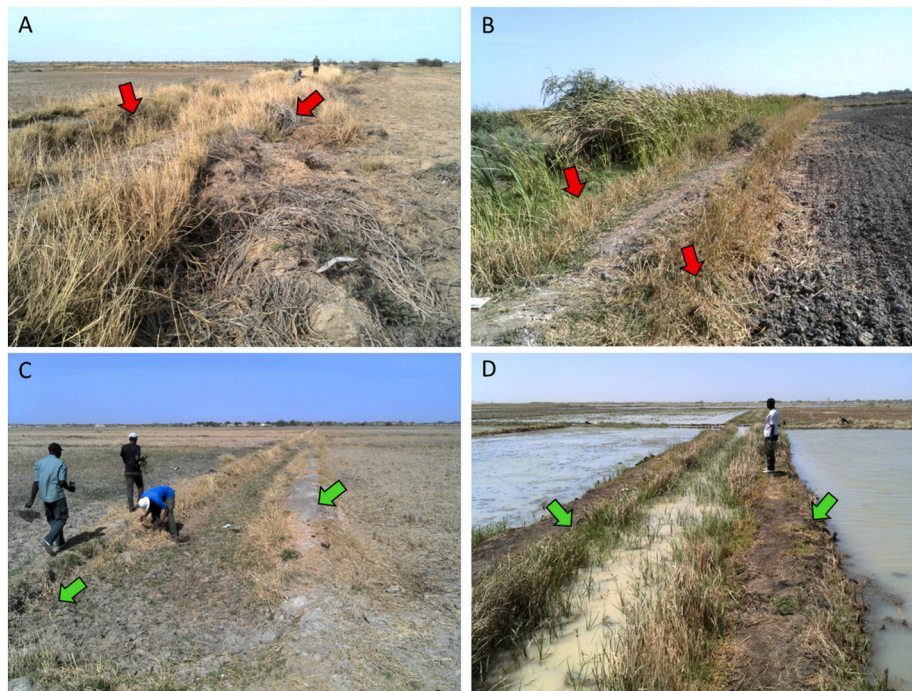
Fig. 3. Illustration of contrasted conditions in irrigated areas of the Senegal River delta.

(A, B) Presence of vegetation favorable to rodents on dikes (red arrows) alongside irrigation canals. (C, D) Controlled vegetation on dikes (green arrows) along canals, achieved through the removal of grasses and bushes near the dikes to create an open strip of land that could enhance the visibility of rodents to predators.