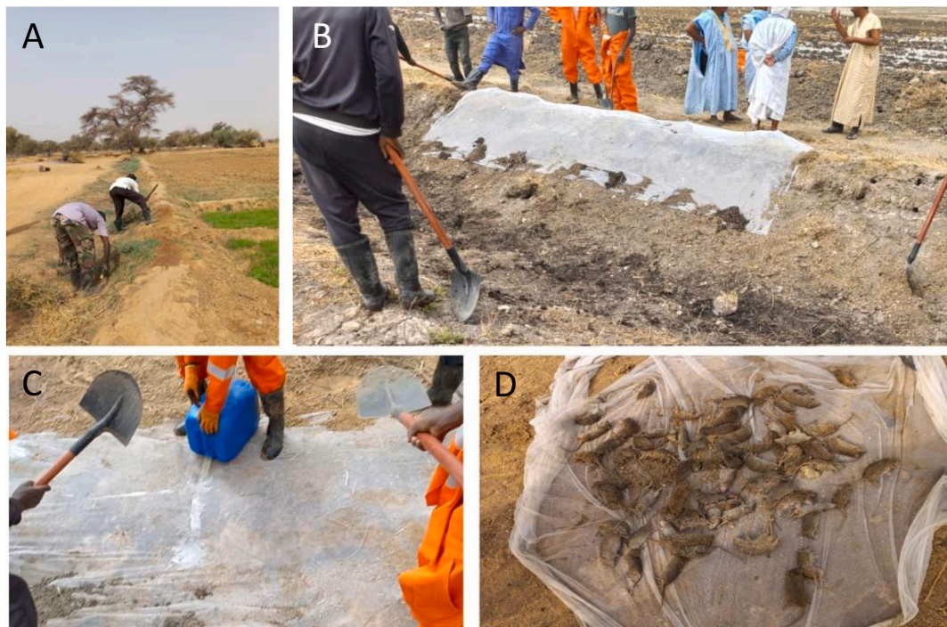
Fig. 4. Awareness-raising and mechanical rodent control actions in Mauritania carried out in 2022.

(A) Clearing the vegetation on dykes. (B) Installation of mosquito nets on the dykes over rodent burrows. (C) Flooding of burrows with water and removal of rodents captured in the nets. (D) Result of a session of mechanical control.