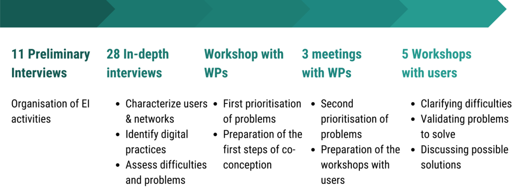
Fig. 2 Process for initial user needs assessment and prioritization implemented by the MOOD consortium in 2020. WP: Work groups of the consortium

Bouyer et al. BMC Public Health (2024) 24:973 Page 4 of 20