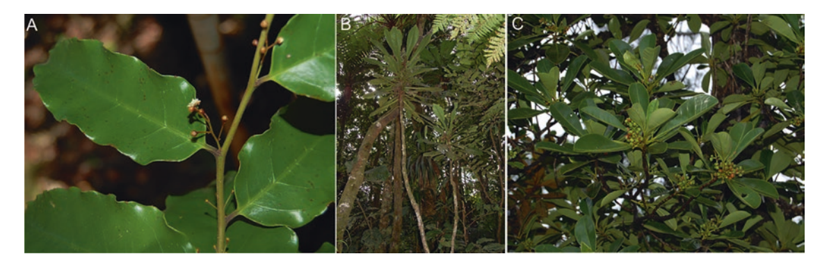
Fig. 3.1 The three endemic families of New Caledonia. (a) Amborella trichopoda (Amborellaceae); (b) Phelline macrophylla (Phellinaceae); (c) Oncotheca humboldtiana (Oncothecaceae)

Climate change could affect species richness in New Caledonia as indicated by a recent study estimated that 87–96% of species could decline by 2070 and up to 15% could become extinct (Pouteau and Birnbaum 2016).