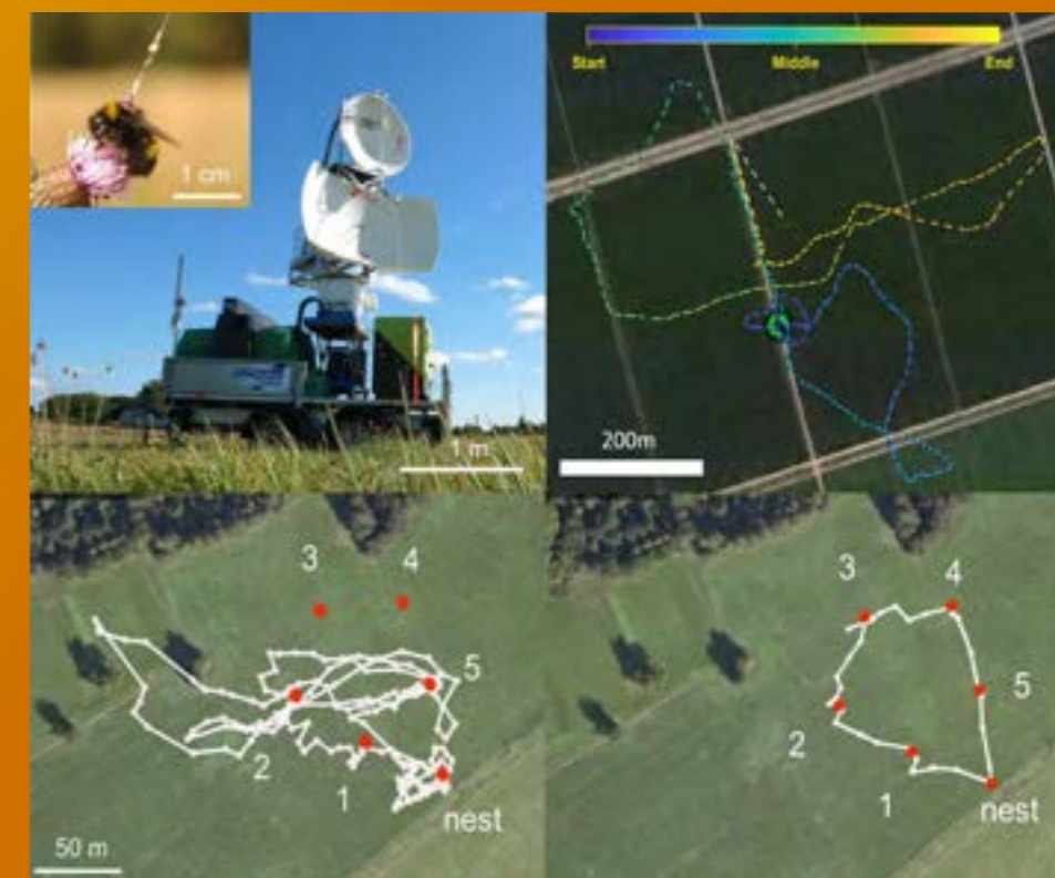
Figure 1: Top left – Bumblebee equipped with a radar transponder and rotating harmonic radar used to track the insects. Top right: Radar track of a bumblebee following footpaths on the ground (modified from Brebner et al. , 2021). Bottom left – Radar track of a bumblebee during its first foraging flight in an array of five feeders (numbers 1–5). Right – Radar track of the same bumblebee after four hours. With experience, the insect developed a near-optimal route to visit the five feeders (modified from Lihoreau et al. , 2012).

The detailed analysis of pollinators’ movements has revealed a ‘navigational toolbox’ that bees use to guide their foraging decisions (Lihoreau, 2024). This means we can now build computational models in order to predict their complex movement patterns (Figure 2). For instance, simple algorithms implementing vector learning (i.e. the fact that bees can learn the distance and direction between two points using the position of the sun and possibly other landmarks) can accurately replicate route development and optimisation by bumblebees (Reynolds